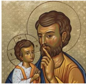
"This is the carpenter's son surely?"