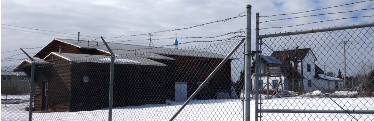
Rear view of the 1967 Fort Kenay building and the 1881 church rectory (the peninsula's oldest documented building) as of April 2017. The church cupola is visible in the background.

Two years after the Alaska Centennial agreement between the church and city, Alex Ivanoff, worn out and suffering from cataracts, died after a fall down a stairway. His funeral at the Holy Assumption Church was a five-hour, two-candle service.