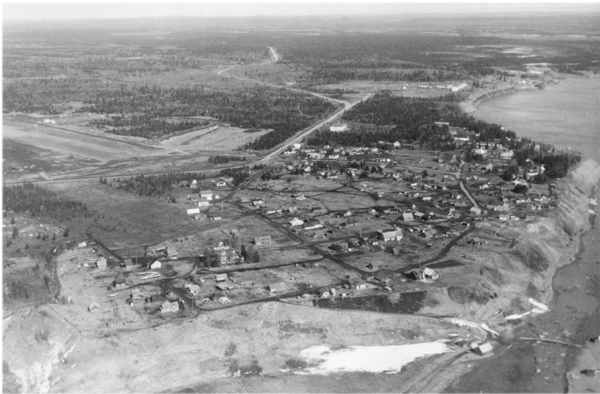
Aerial image of Kenai in the early 1950s.

With the settlers came new churches. The first Protestant missionaries in Kenai were sent by the Slavic Gospel Association, a Chicago group whose specific goal was to wrest souls from the Orthodox church. Other Protestant denominations followed.