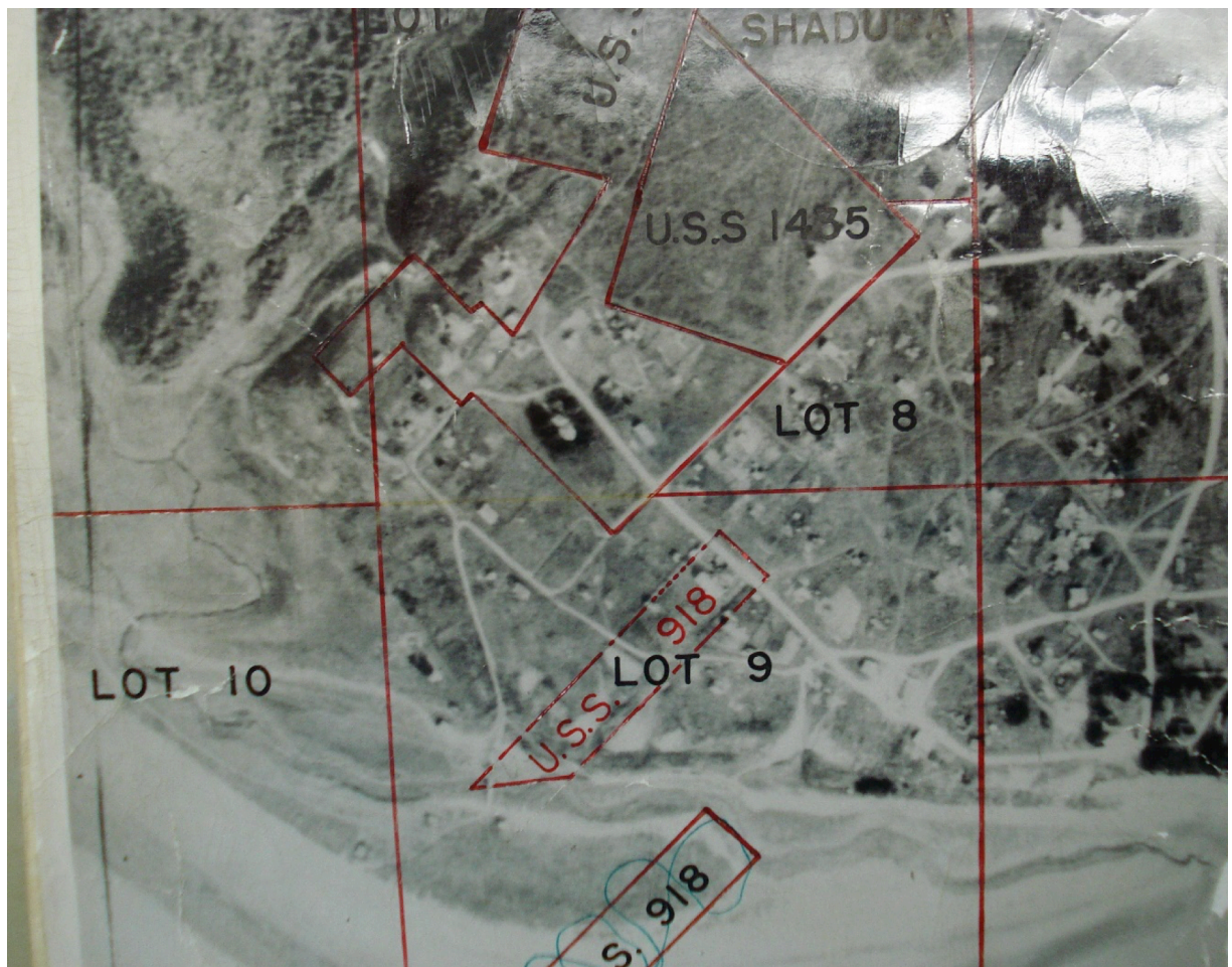
Aerial image of Kenai, 1949, overlain by surveyors' marks showing preexisting private land. This was used to prepare for the survey of old town home lots.