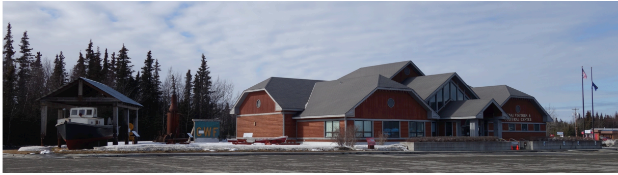
The Kenai visitors' center in 2017.

Father Targonsky never made it to the groundbreaking that day. But such a display of discord was, if anything, perfectly appropriate to the historic occasion. For 150 years, battles between the Church and local merchants had been a recurring theme of life in Kenai.