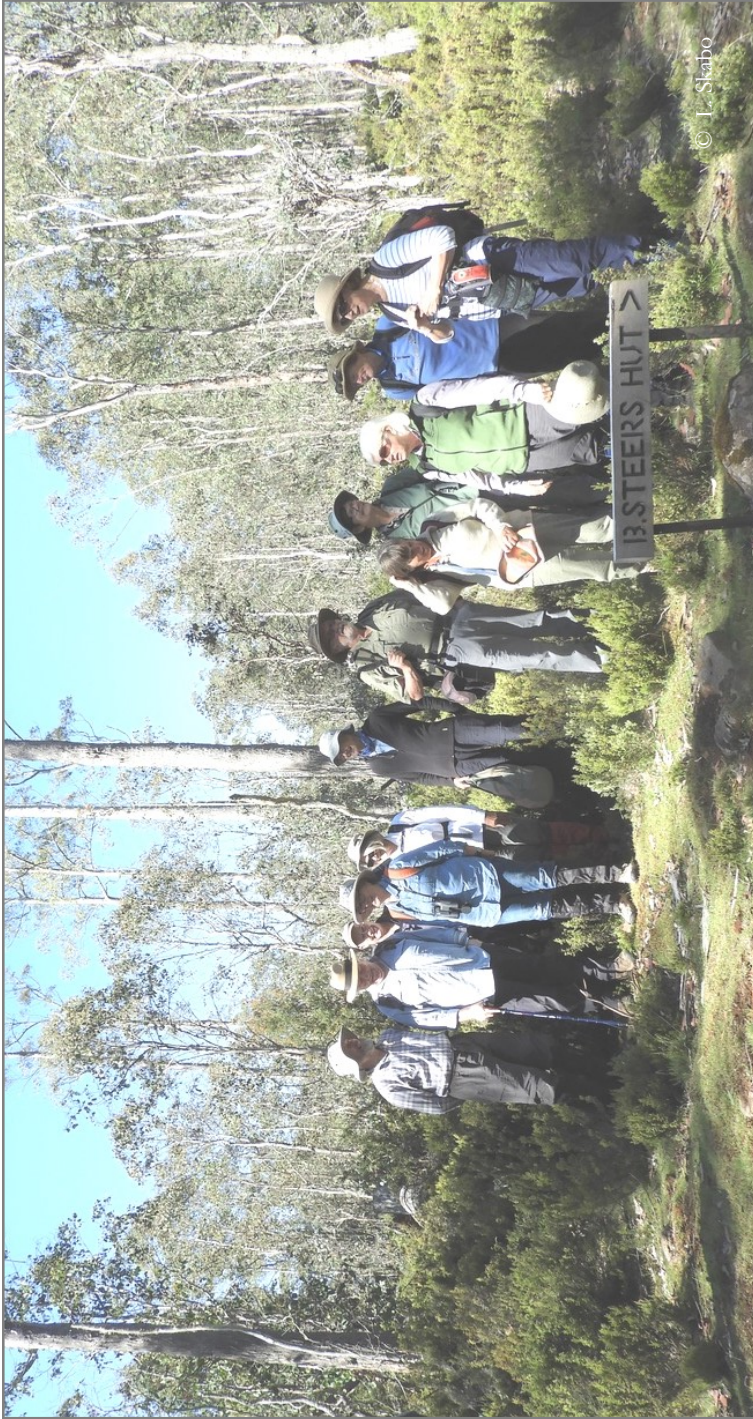
Northern Group members at the start of the February Plains walk See Northern Group report, page 28.