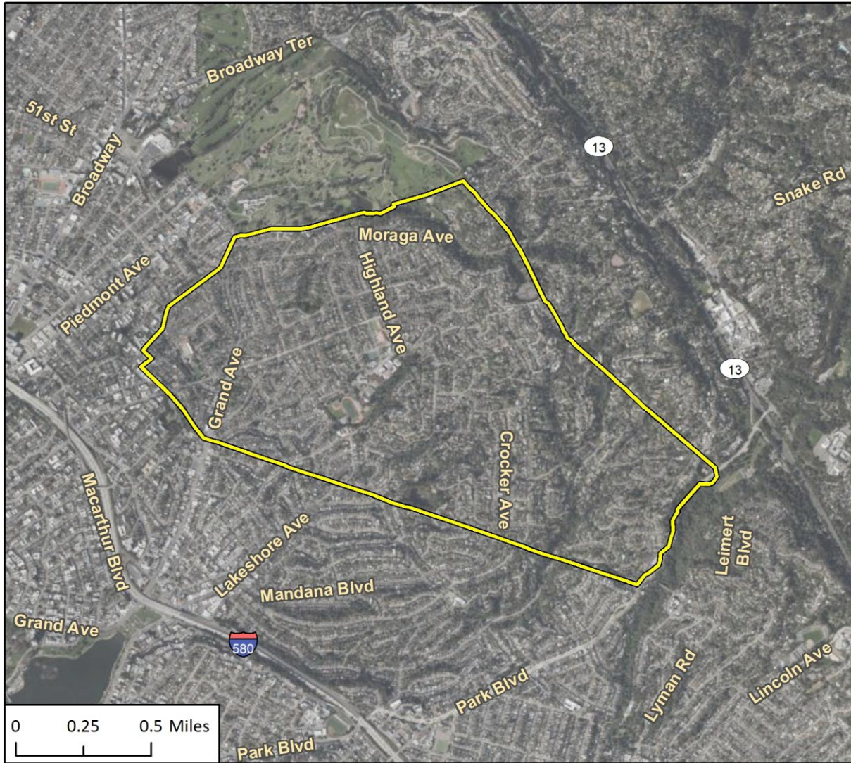
Figure 1 City of Piedmont Location Map