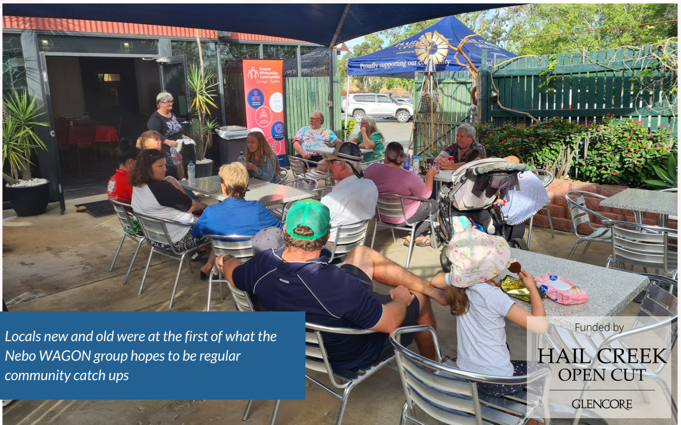
Locals new and old were at the first of what the Nebo WAGON group hopes to be regular community catch ups

The event was a good sign for things to come, with the group motivated and planning to hold another event in August 2021. Thanks to IRC Community Relations Officer & Glencore Community Relations Officer for their support.