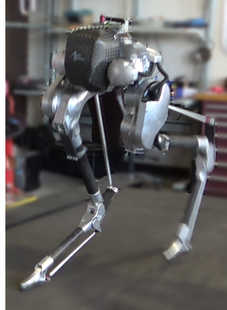
Fig. 2: A picture of Cassie running at 3.2m/s.

We use a feedforward neural network ([1] uses an LSTM recurrent neural network) trained using the PPO algorithm in a MuJoCo simulation of Cassie. During training we arbitrarily assign (using visual heuristics) a single given swing ratio and stepping frequency for each possible commanded speed. We train on speeds between 0 and 4 m/s. For the corresponding swing ratio and stepping frequencies commanded at each