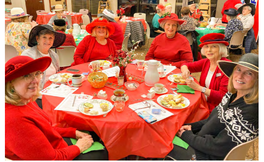
WELCA CHRISTMAS TEA On Dec. 1, WELCA celebrated their Christmas Tea Party! So many amazing hats and tea cups!