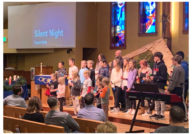
FESTIVAL OF MUSIC Our congregation's musical talents were on display on Dec. 18! Thanks to all our participating ministries for such a special day.