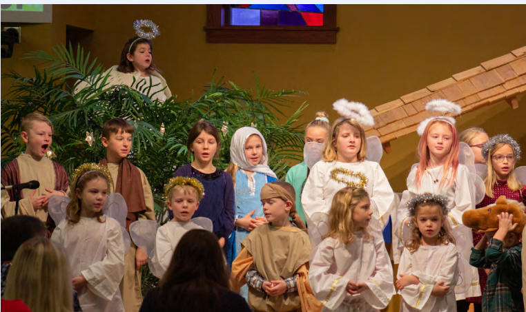
CHRISTMAS PROGRAM On Dec. 11, Children's Ministry performed their annual Christmas Program with a craft/cookie reception! More on pg. 8.