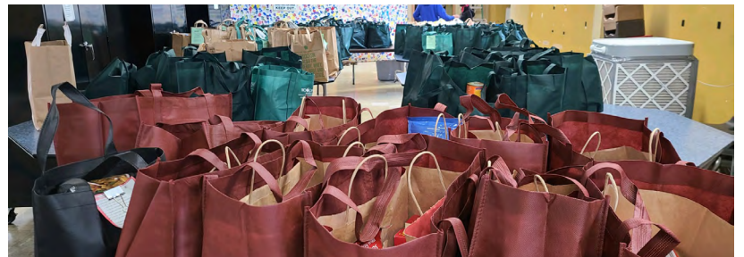
CHRISTMAS MEAL WITH ALL PEOPLES CHURCH Our food drive with All Peoples Church was a success! Over 100 families served, with blankets handed out as well! Thank you for your generosity!