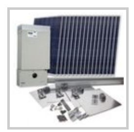
Home Solar Panel Kits Come To Costco « (this site)