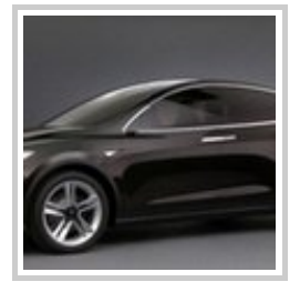
Tesla Motors Model X Smokes $40 Million In A Day (this site)