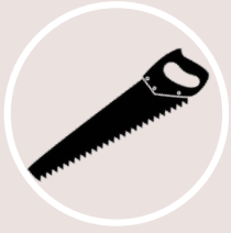
Saw (fine tooth)