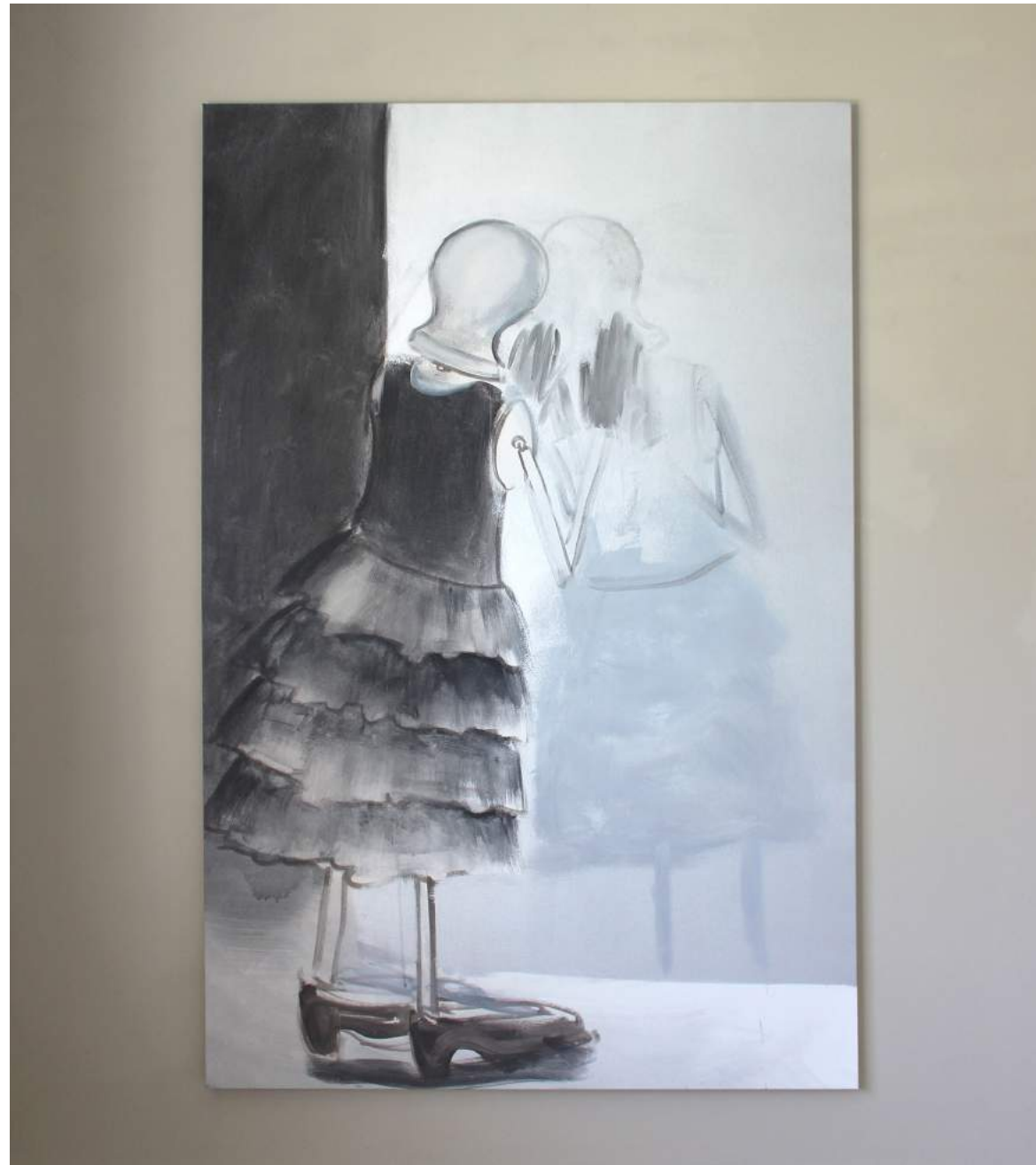
Lisa Milroy MirroR 2011 Oil and acrylic on canvas 170 x 112 cm 66 7/8 x 44 1/8 in