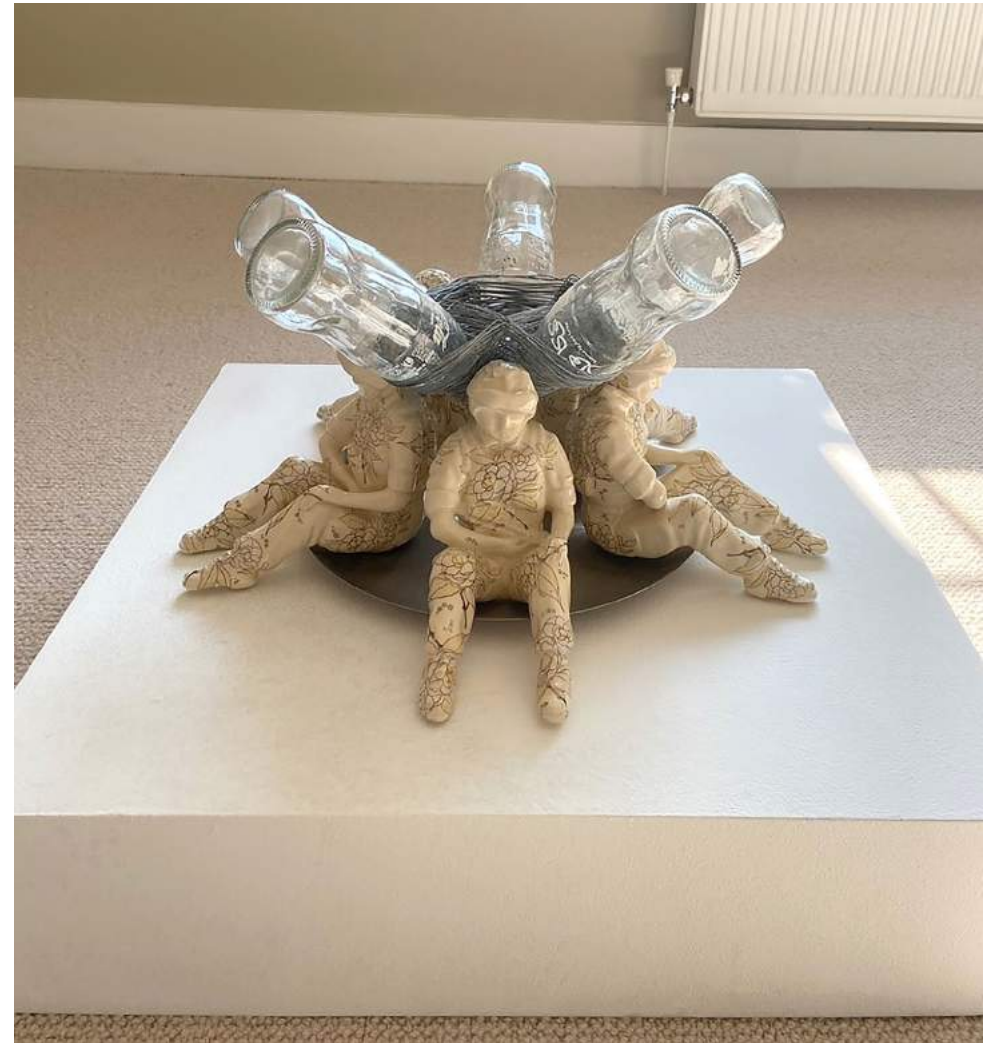
Carol McNicoll Freedom and Democracy 2011 Ceramic and found object 23 x 46 (diameter) cm 9 1/8 x 18 1/8 (diameter) in