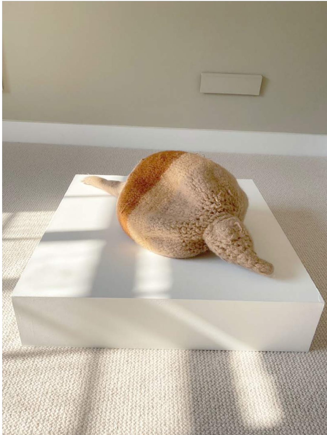
Nicholas Pope Envy Woolie 2004 Felted wool 24 x 73 x 30 cm 9 1/2 x 28 3/4 x 11 3/4 in