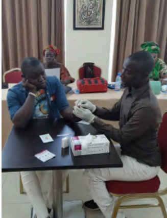
Community partner staff being trained on community testing in Mali