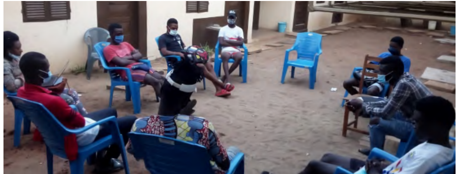
Legal assistant conducting empowerment training on human rights at the Cupidon drop-in center in Togo

for some concern after typical reach and testing activities at hot spots produced low HIV case finding. But thanks to technical assistance received through the local KPIF technical advisor and monitoring and evaluation officer, the teams have worked through the challenges, including learning how to successfully implement passive index testing with MSM.