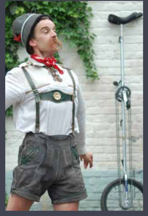
This event has been made possible with funding by Creative Ireland.