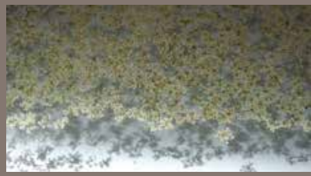
Naomi Draper, Veil. Lithograph (Edition of 10