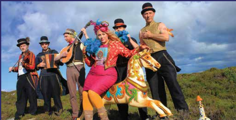
Thanks to Yeat's Country Hotel for their generous sponsorship

"...an interesting hybrid of traditional Balkan music and jazz ... loads of infectious grooves" Music Review Unsigned