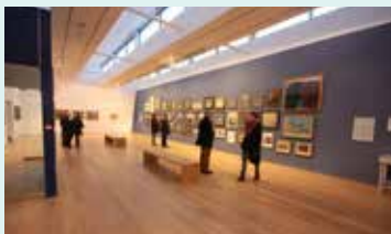
Shared Visions , The Niland Gallery