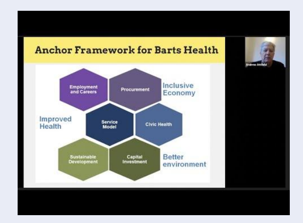
How different places are developing their anchor mission - a recording from a previous Health Anchors Learning Network lunch and learn event