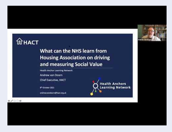
What can NHS anchors learn from Housing Associations on social value? - a recording of a webinar hosted by HACT on driving and measuring social value