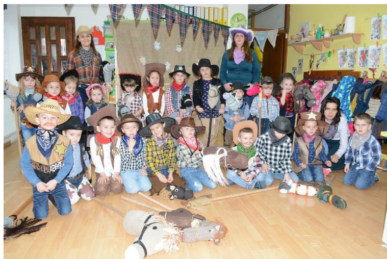
RS-104 Kindergarten KORAB in Pivnice, Serbia

The Methodist work in Vojvodina (the northern part of what is now Serbia) was started more than 120 years ago. German missionaries established local churches among German emigrants – and this was the reason why the churches were exclusively German-speaking until 1904. In the following years, the work grew, and thriving new churches were born among other population groups, as well. But there was not only joy and growth. The church experienced persecution, suffering, isolation and setbacks, as well – mostly because of political reasons. Today a varied children's and youth ministry, Christian outreach programs, local and regional activities for women and men, as well as practical help for people in need are some of the priorities of the local churches, which combine both the proclamation of the Gospel and love in action. In a country still falling on hard times while looking for a future, they aim to help people to discover God's love – beyond any border of ethnicity. The fact that a new generation has accepted the calling into the ministry of the church and is taking the lead regarding this aim is an important sign and a source of hope. Despite political and ethnic tensions on the Balkans, the local churches in Serbia, Albania, and North Macedonia still belong to the same Annual Conference.