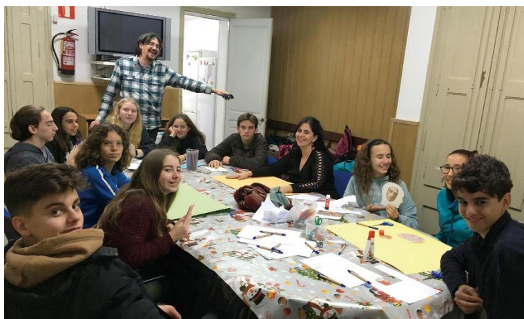
SP-107 Discovering new Realities in Catalonia: Course for young people to make them aware of different realities and situations that can be found in their cities, in their country and in Europe.

This project is a key part of our mission plan as a local church. The focus of the project is on developing stronger relational links with those on the fringes of our community, by offering a yearly programme of activities that are inclusive, attractive and accessible. This essentially missional project contains elements of "fresh expressions" of church, exploring new ways of being community and the intersections between the arts, ecology and Christian discipleship and spirituality. (BLC)