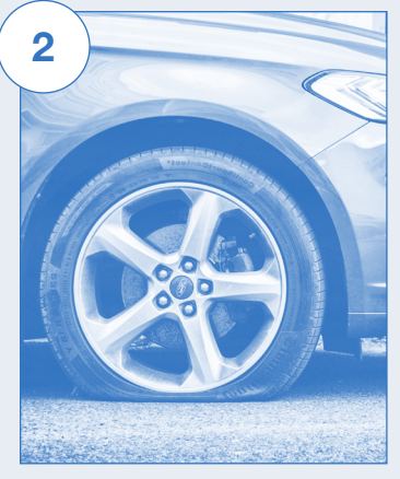
She had to replace a flat tire on Monday, which left her with no grocery money on Wednesday.