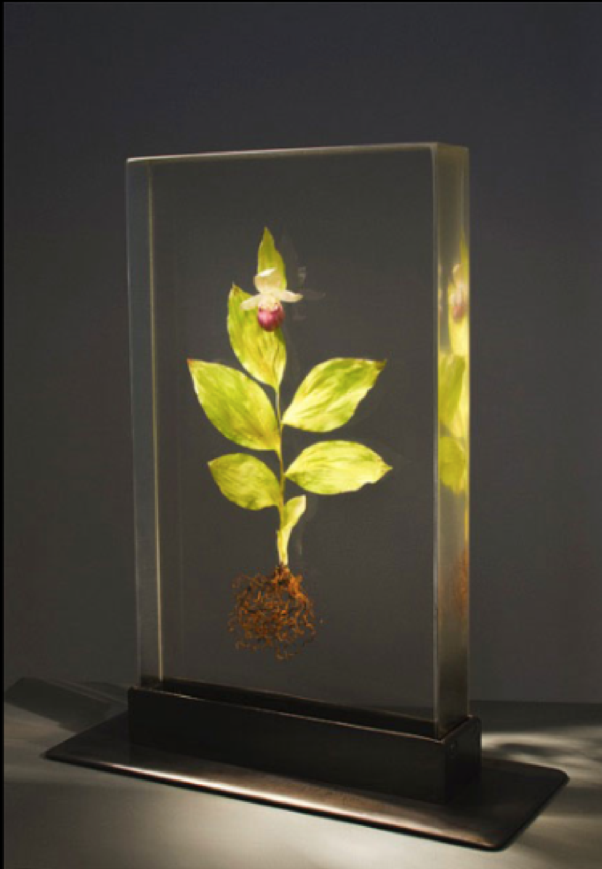
Showy Lady's Slipper , 2015, flower, composite, glass and steel, 27.5 x 20 x 8 inches