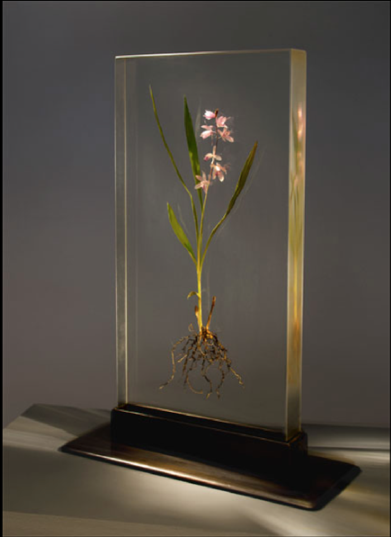
Hardy Orchid , 2015, flower, composite, glass, paint and steel, 27.5 x 20 x 8 inches