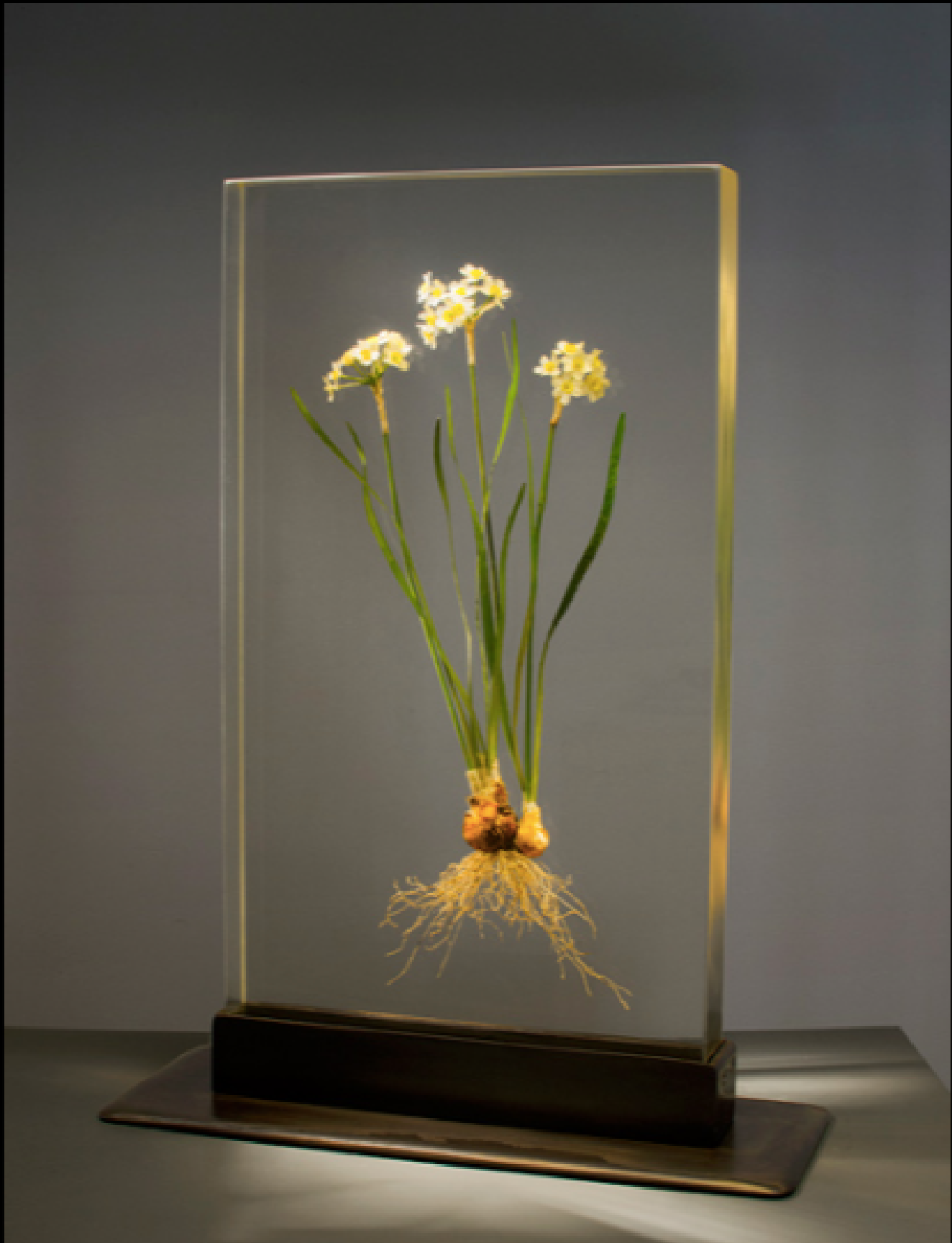
3 Bloom Tazetta , 2015, flower, composite, glass, paint, and steel, 27.75 x 21 x 8 inches