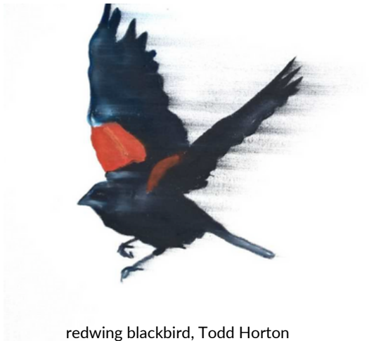
redwing blackbird, Todd Horton