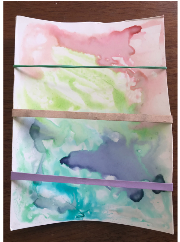
Painted matboard with rubber bands: Ready for weaving!