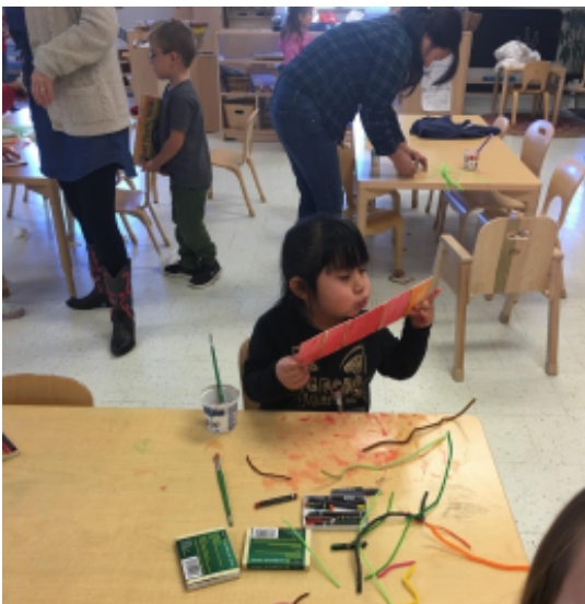
Student working on her "blanket"