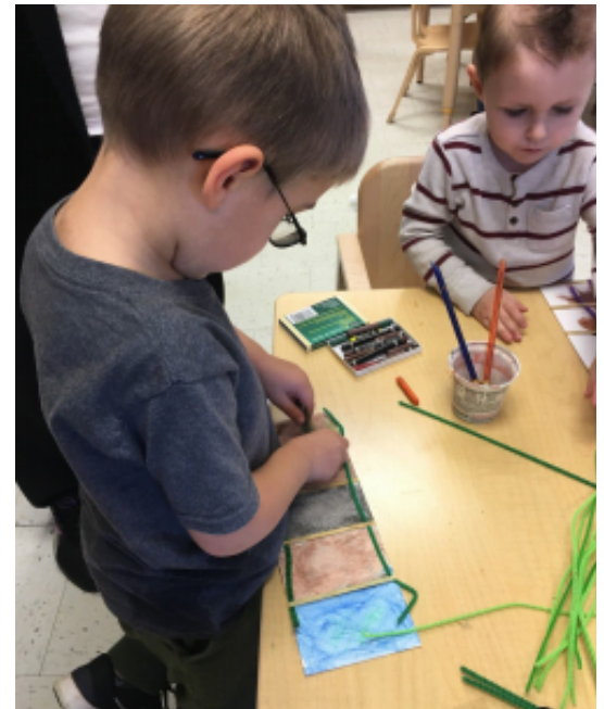
Student weaving