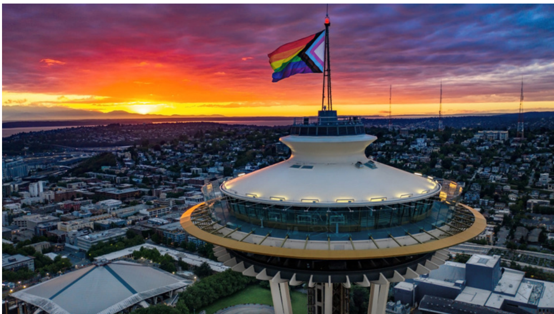
Left: Photo of Quasar's flag