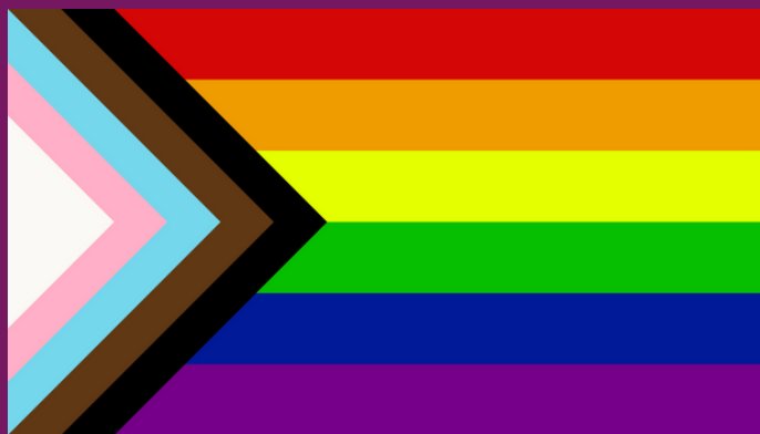
Quasar's Redesigned Pride Flag