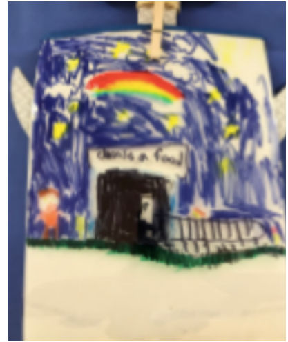
Above: Student example