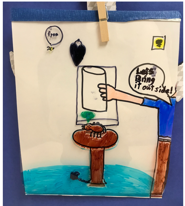
Student example