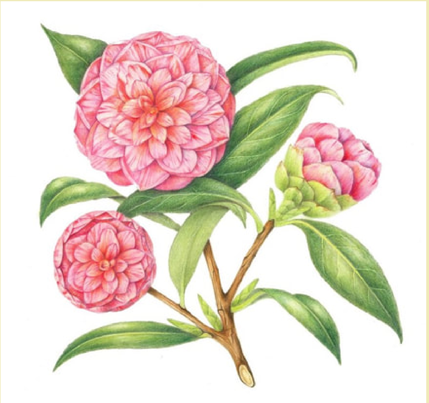
Origami Camellia , Dorota Haber-Lehigh