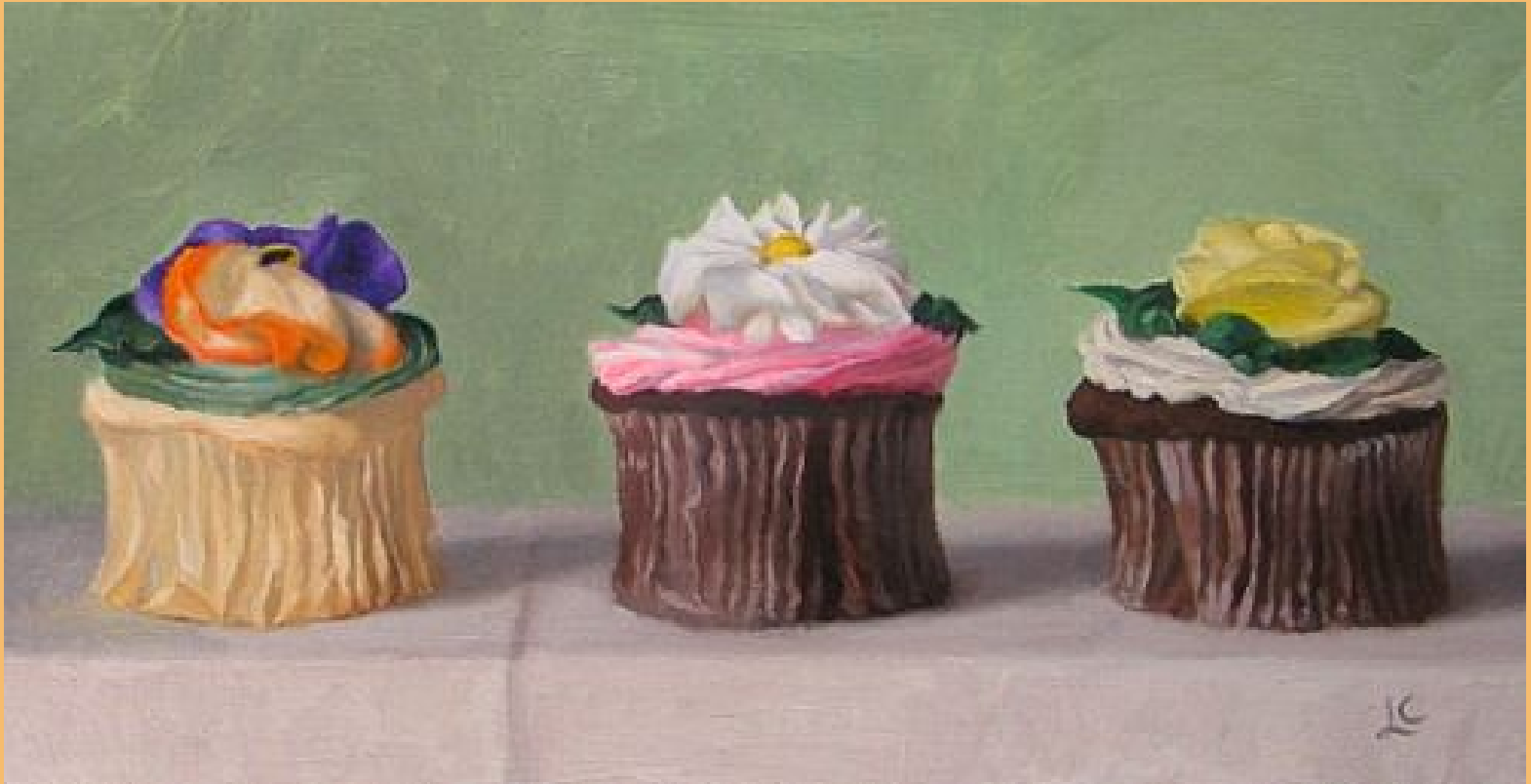
Three Cupcakes , Lisa Caballero