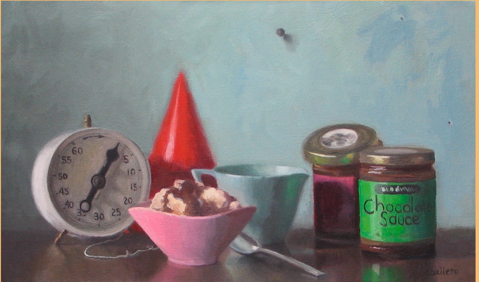
Chocolate Sauce Vanitas , Lisa Caballero, 2012