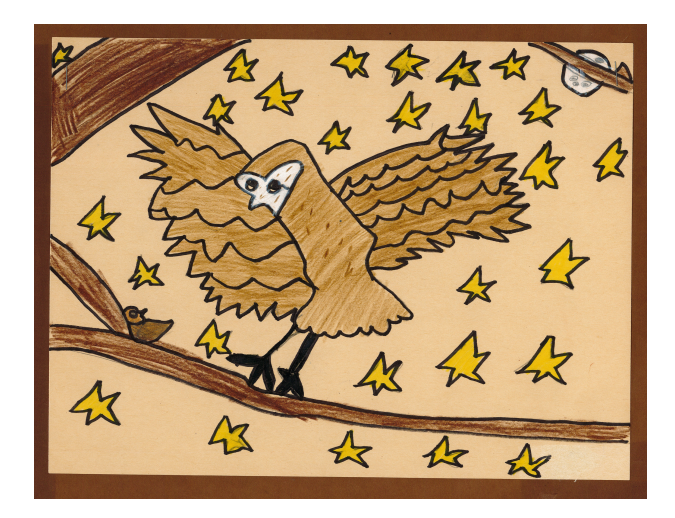
Student examples