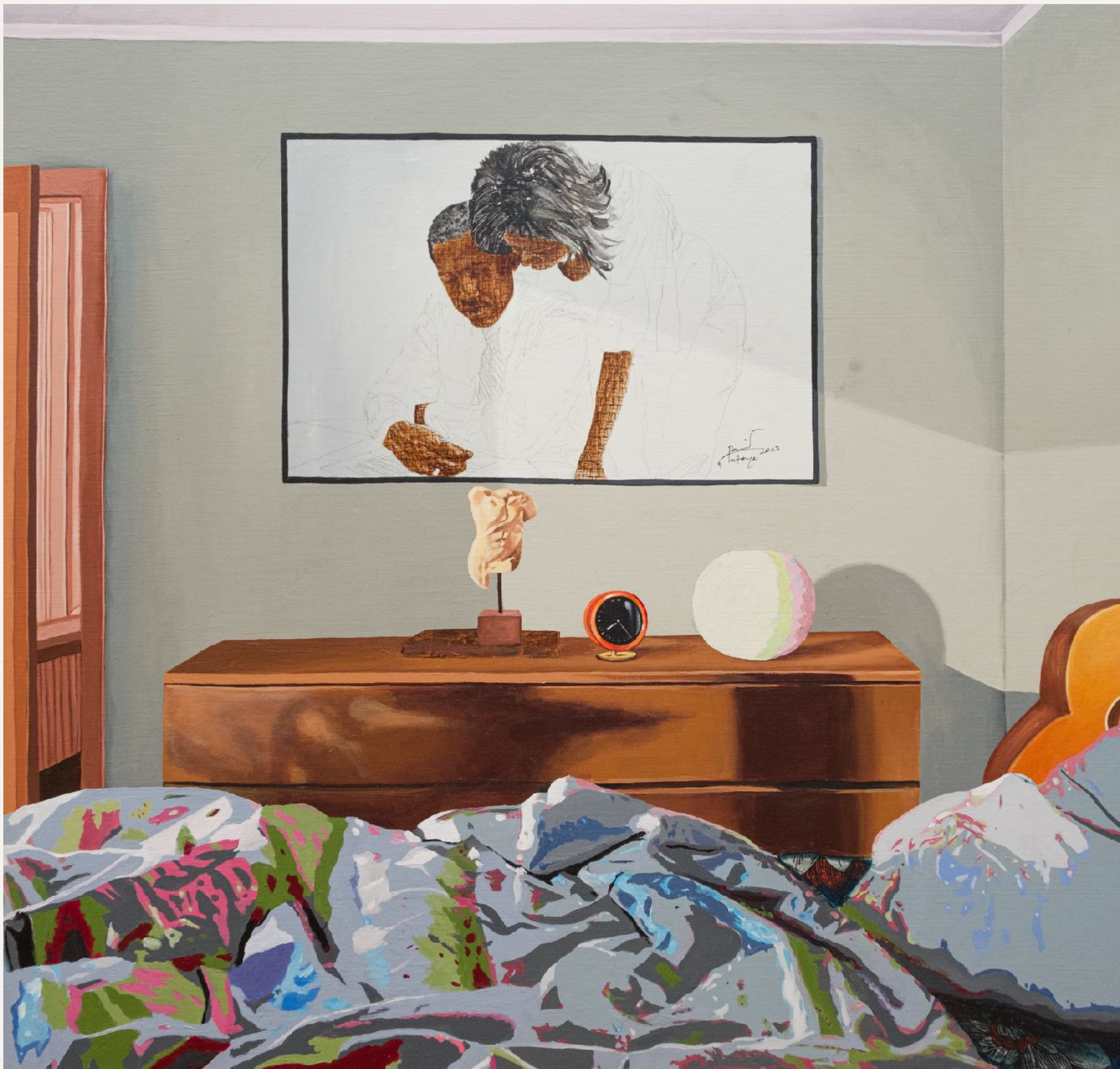
DUVETS ARE FOR COLD DAYS II

Pen and Acrylic on canvas 91. x 91. cm (36.4 x 36.4 inches) USD 6,700 (Excl S.A vat)