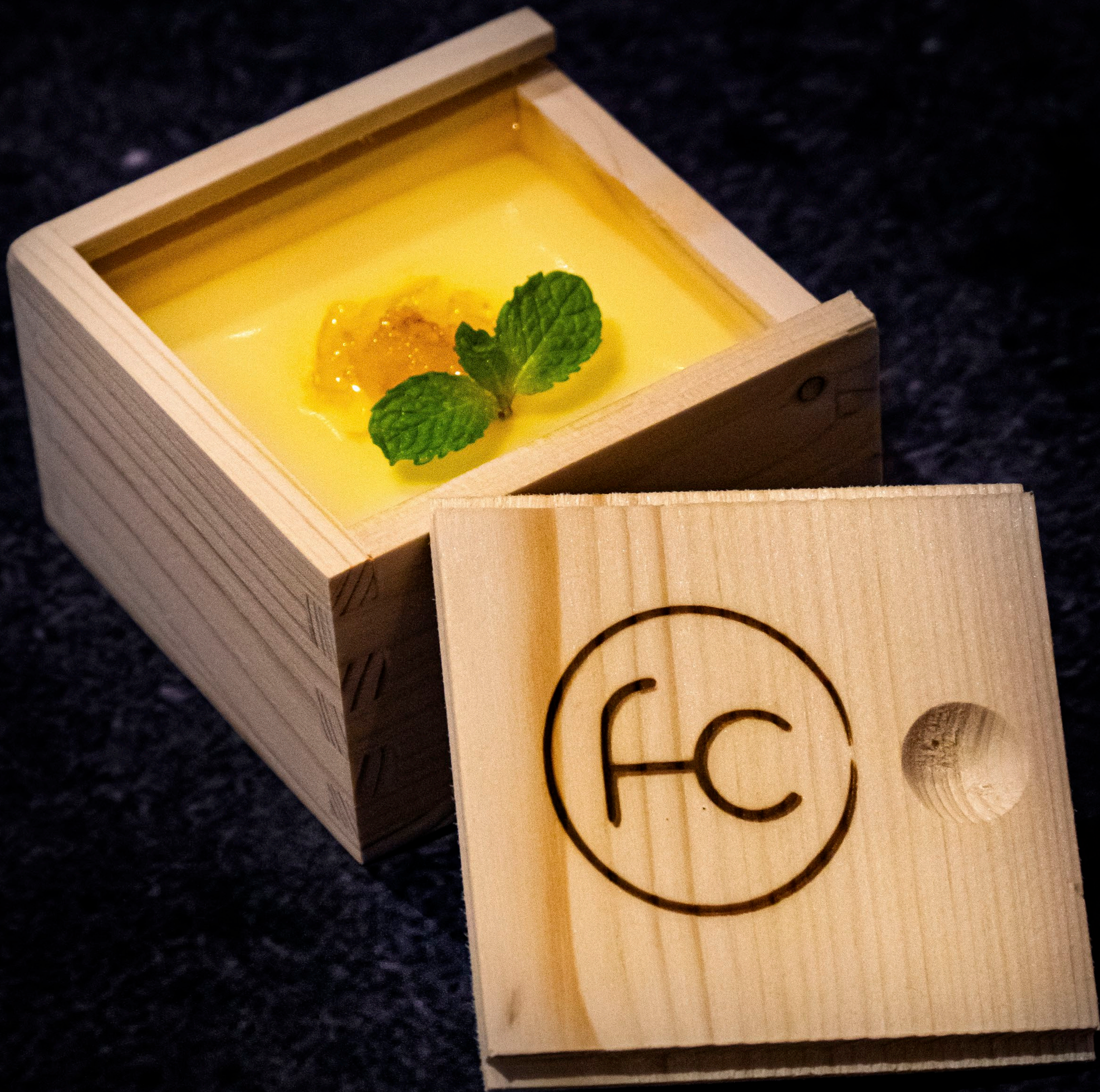
HOUSEMADE YUZU CHEESECAKE