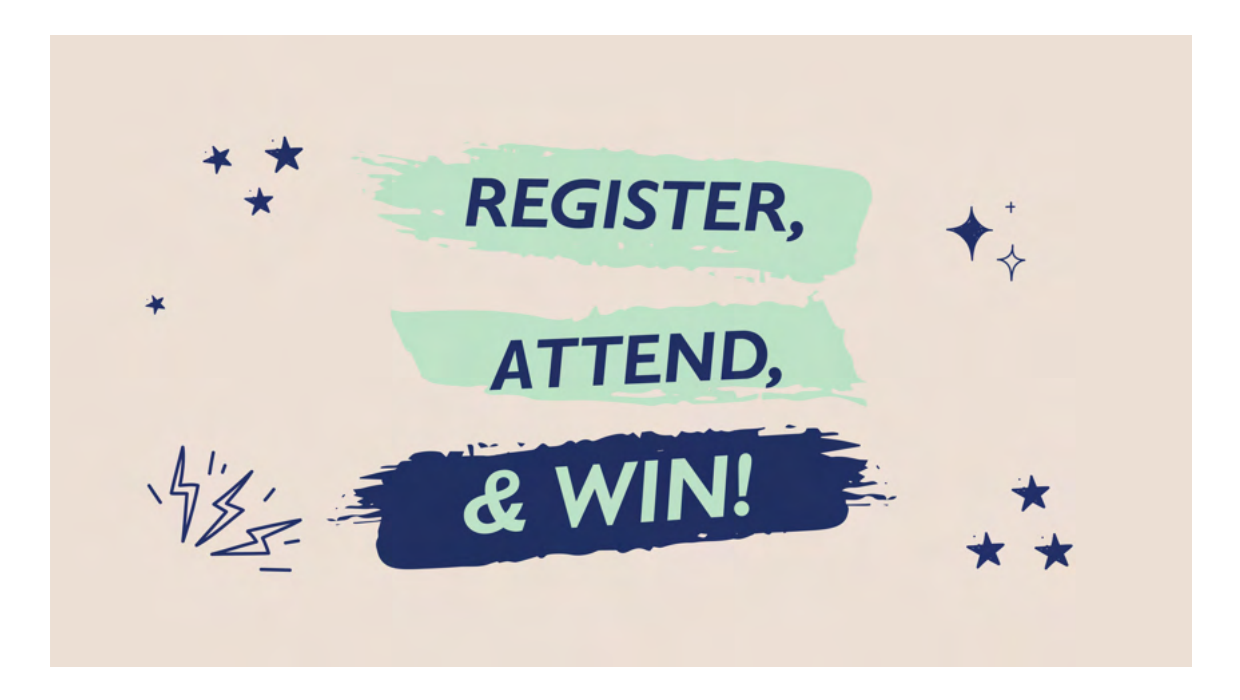
Youth Participants who stay for the entire event will receive 30$ gift vouchers to Chapters/Indigo or UberEats!

When you register, you will choose one workshop and one break time entertainment to participate in.