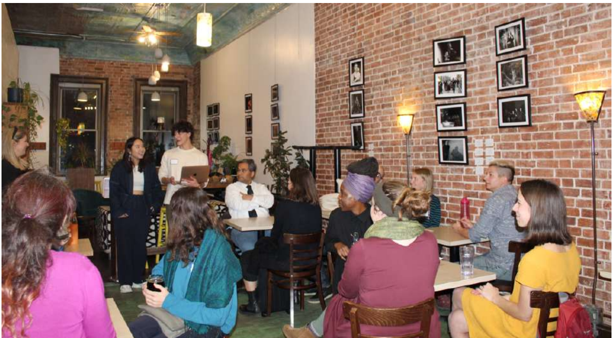
Salut les voisins à Sherbrooke

There are over 1 million English-speakers living in Québec, each with a unique story to tell. Hear from our team of Community Liaisons as they share a slice of English-speaking life from all across the province! From moving to Québec from elsewhere in Canada, to exploring nature in a whole new way, our Liaisons have plenty to share with you. Check out Y4Y's Community Liaisons' blog posts here .