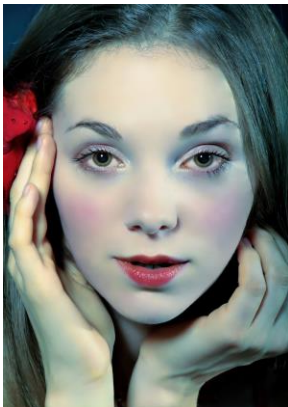
Porcelain Columbine , APradzynski