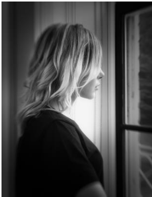
Pensive , GCorman

Sampler of Photography and Art Hung in 2022 FORMS, FACES & SPACES, figuratively speaking!