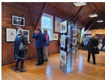
Gallery Visitors - 2022 exhibit