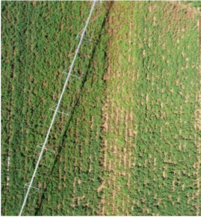
Figure 2. Image captured by a drone highlighting a problem area and its extent. It still requires ground truthing to determine the cause of the problem

drones on your property. In most cases licenses are not required for small drones, but it is important to be across the rules and regulations. Find the most up-to-date information on the Civil Aviation Safety Authority (CASA) website.