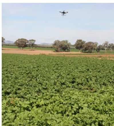
Figure 1. A drone being used to scout a potato crop in NSW