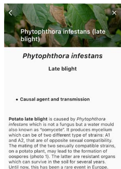
Figure 3. An example of how the app can be used. NOTE the information for late blight in this context is for France. For effective management of diseases and pests please ensure Australian resources are used.