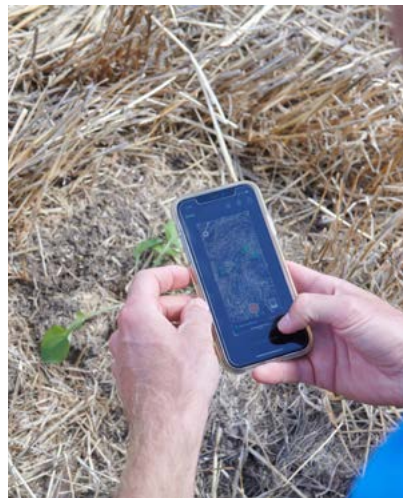
Figure 4. David Brunton using the Xarvio app to identify a weed

In Australia, the focus of the app has been on its application to support the management of broadacre grain crops including canola, barley, and wheat. While it does not currently offer analytical features specifically for potato crops, growers are already