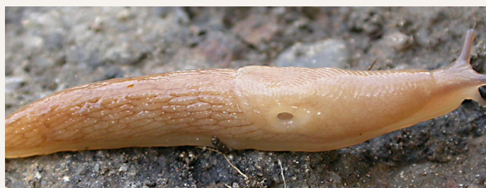
Grey field slug ( Deroceras reticulatum ); 50mm long. PEST: Yes (all crop types)