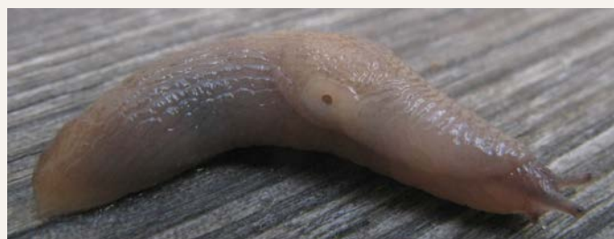
Brown field slug ( Deroceras invadens ); 30mm long. PEST: Yes (all crop types)