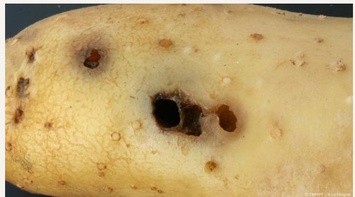
Perforations and holes caused by slugs