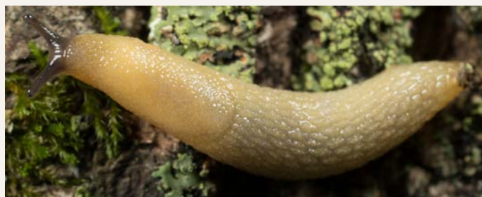
Hedgehog slug ( Aron intermedius ); 20mm long. PEST: Yes (wheat and pasture)