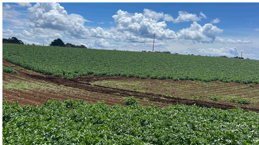
Waterlogged ares are more prone to disease

However, once the paddock has dried, a light cultivation can be used to break up the crust to allow water and oxygen to penetrate. Care should be taken during cultivation not to cause further damage the soil structure.