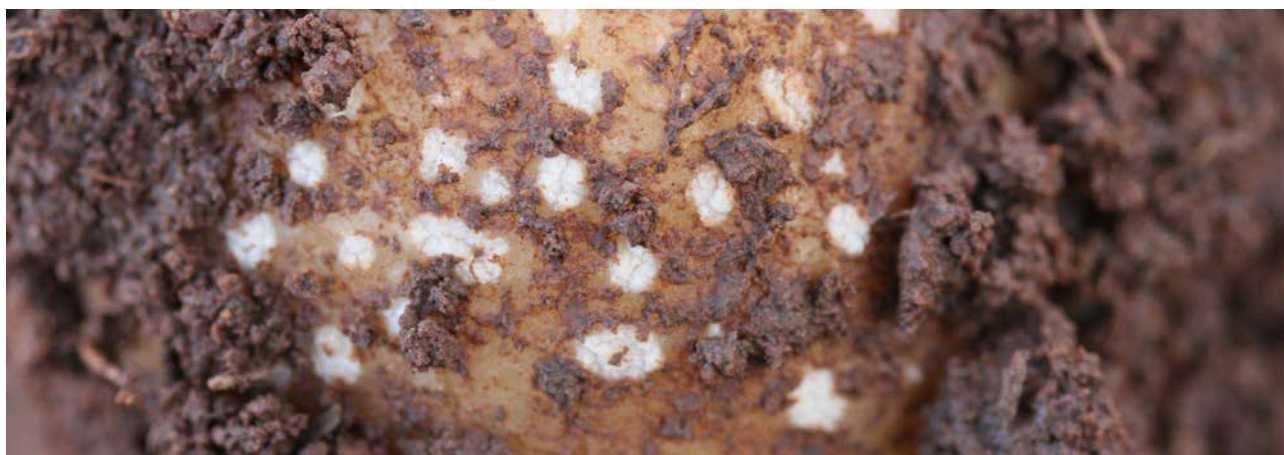
Puffed lenticels on waterlogged potatoes