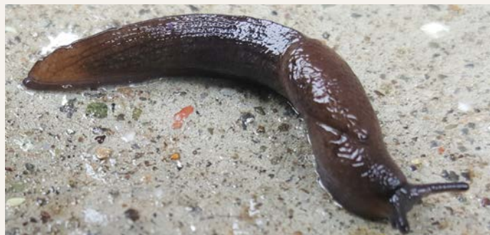
Black keeled slug ( Milax gagates ); 50mm long. PEST: Yes (all crop types)