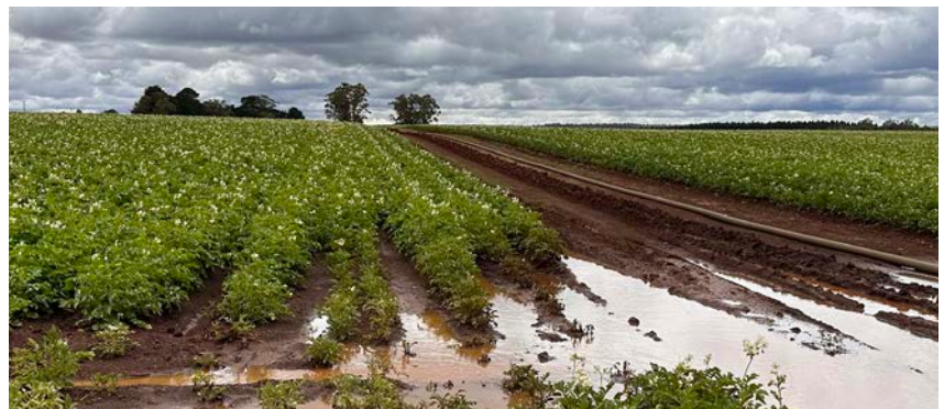
Waterlogging in Ballarat, Feb 2023 - J Ekman

The many benefits of cover crops and green manures to soil health are widely known. These extend to helping soils prepare for a deluge by promoting a good physical structure through the addition of organic matter