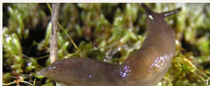
Marsh slug ( Deroceras laeve ); 25mm long. PEST: Yes (all crop types)