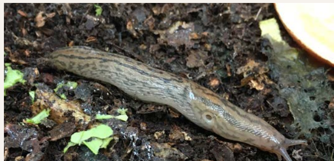
Striped field slug ( D. nyctelius , Ambigolimax valentianus ); 70mm long. PEST: No