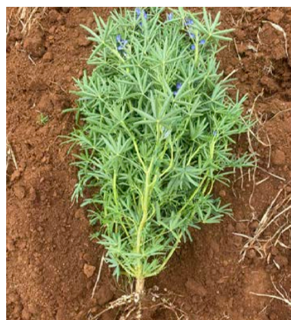
Root development and nodulation on different cover crops - D Long