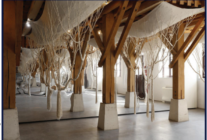
Janaina Mello Landini 2

As I was driving to campus for class, I suddenly remembered the treelike forms she creates using one simple material: strands braided into rope; using the artisanship of rope making (and unmaking), she twists out branches and roots and even entire trees. It dawned on me quite simply that the roots felt incomplete because they were only part of the whole: we needed the full tree to be seen.