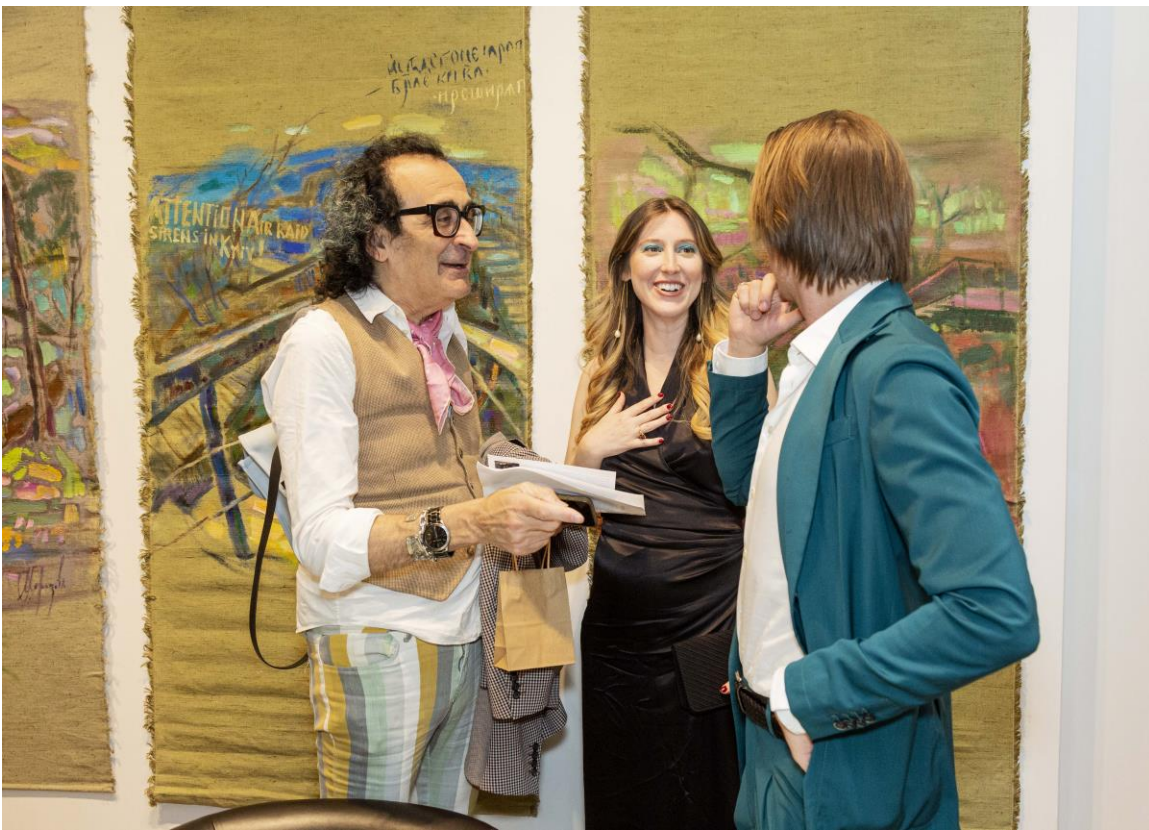
Palo Gallery NYC 2023