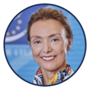
Marija Pejčinović Burić

Deputy Assistant to the President and Deputy Director for Science and Society in the White House Office of Science and Technology Policy