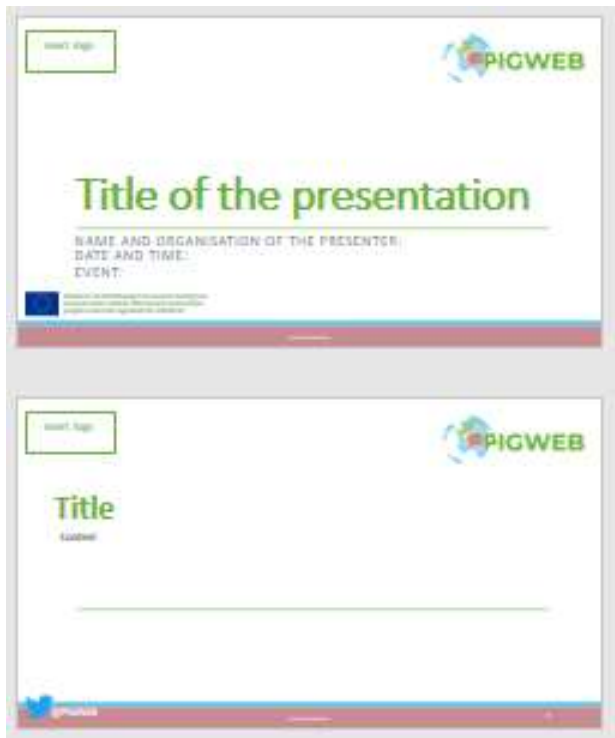
Figure 4 PIGWEB Presentation Template

The presentation template of PIGWEB includes the PIGWEB logo on the top right corner. The logo of the partner institution can be inserted on top left corner. It includes the title, name and organization of the presenter, date and title of the event. It also includes the PIGWEB Twitter account name and PIGWEB's website link at the bottom of the slides. EU acknowledgement is the key for all documents produced under PIGWEB project.