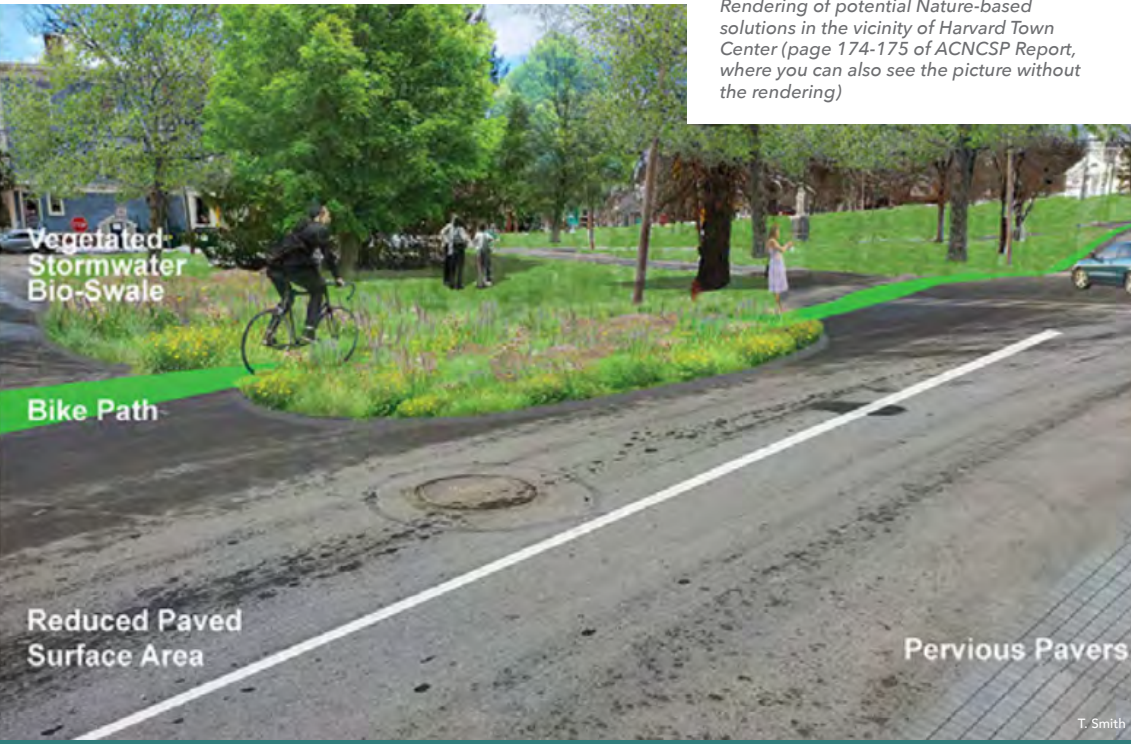
Rendering of potential Nature-based solutions in the vicinity of Harvard Town Center (page 174-175 of ACNCSP Report, where you can also see the picture without the rendering)

The Apple Country Natural Climate Solutions Project (ACNCSP) encompasses three municipalities - the Town of Bolton (Bolton), the Devens Regional Enterprise Zone (Devens), and the Town of Harvard (Harvard) - regionally known as Apple Country. The collaboration serves to enhance Apple Country's climate resilience by identifying healthy ecosystems to conserve in the region, and identifying locations that are ripe for ecological services restoration and management.