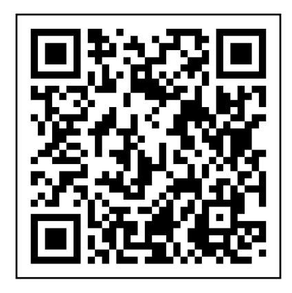
Scan to learn more and see our photo gallery

Despite the area's changing economic conditions and natural disasters, the club has continued to provide a great golfing experience to locals and visitors alike. The Crowsnest Pass Golf Club remains a prominent part of the region's history and its ongoing passion for golf.