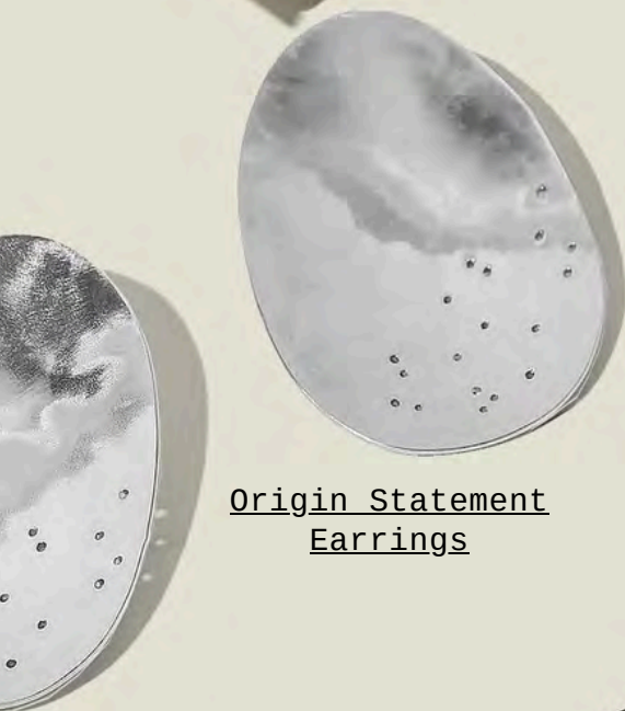
Origin Statement Earrings