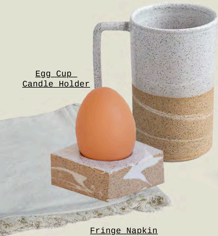
Egg Cup Candle Holder