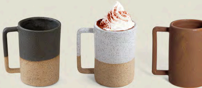
Classic Campfire Mug