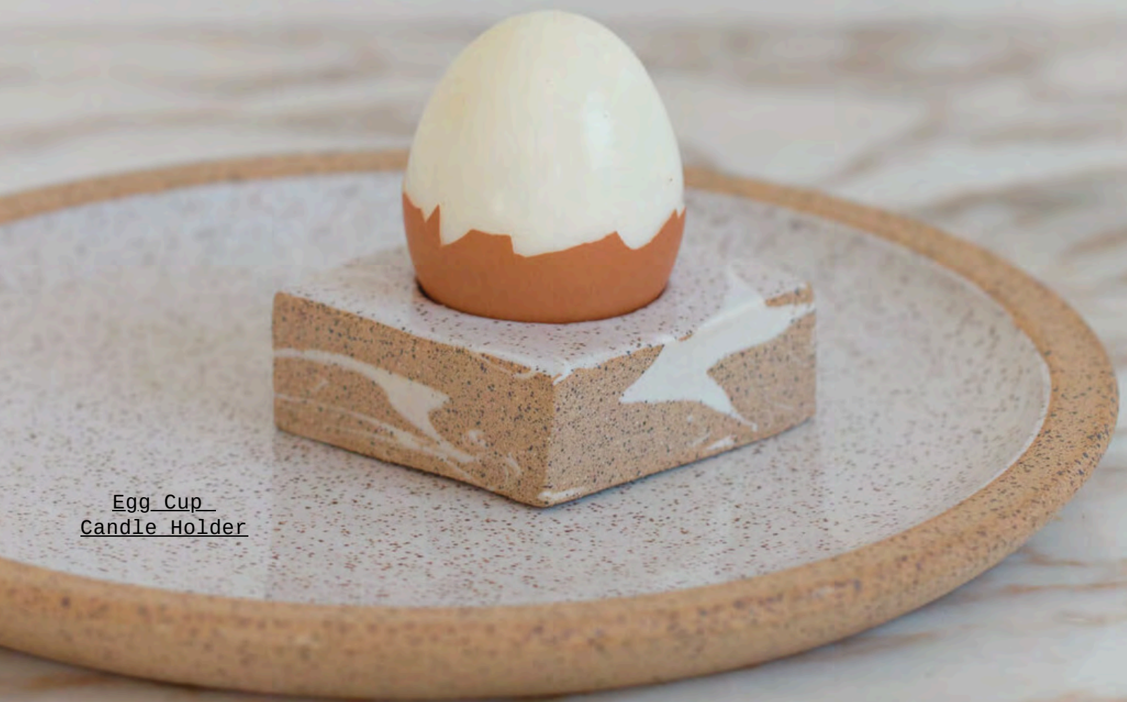
Egg Cup Candle Holder