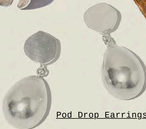
Pod Drop Earrings