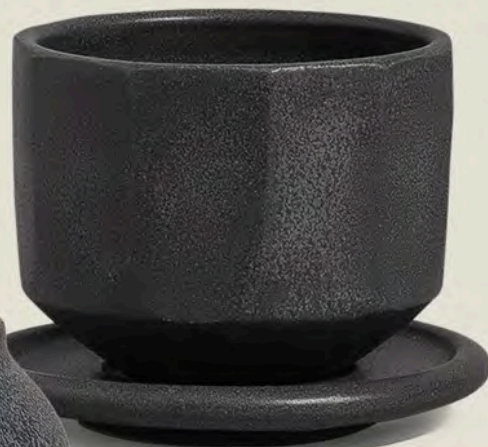
Latte Cup and Saucer