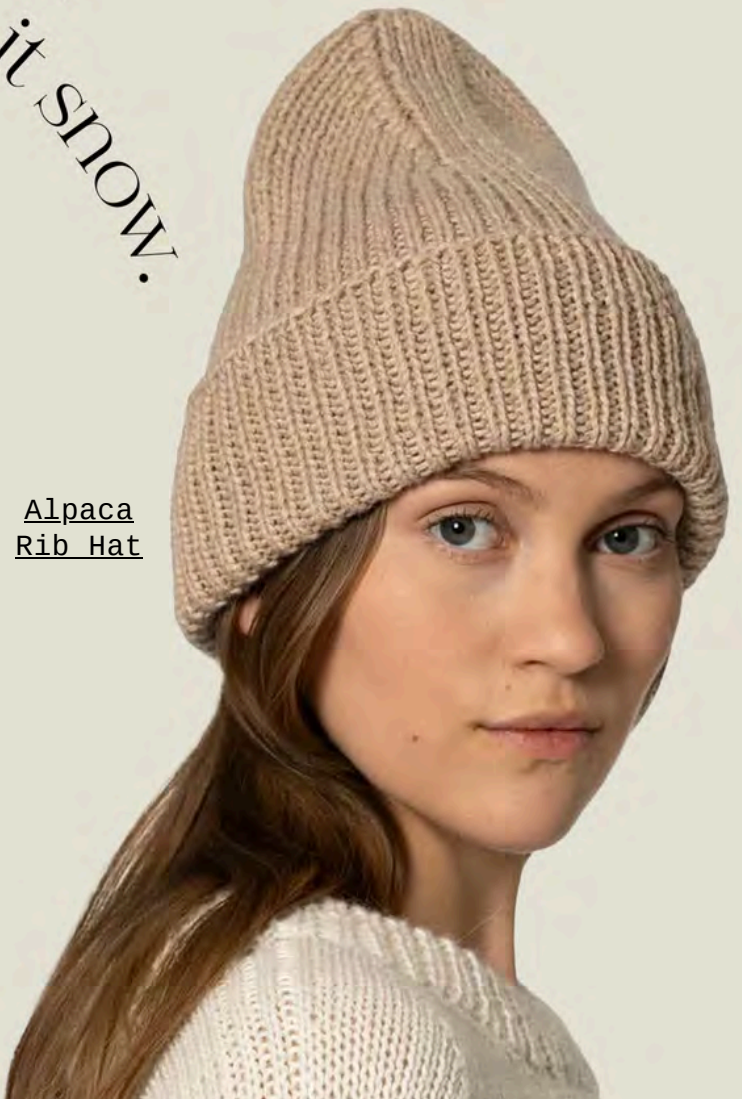
Alpaca Rib Hat