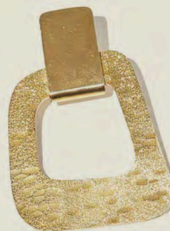
Mod Door Knocker Earrings