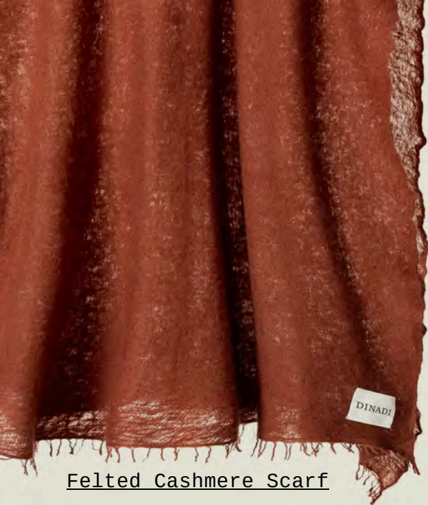
Felted Cashmere Scarf