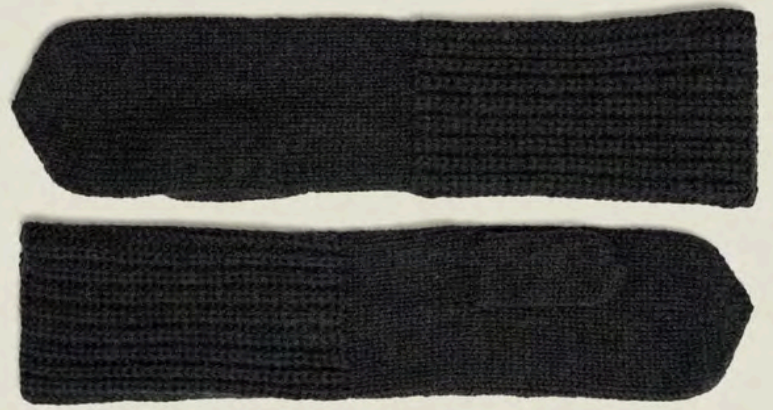
Merino Long Mittens