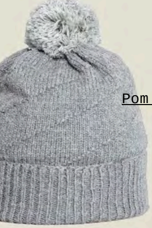
Pom Pom Beanie