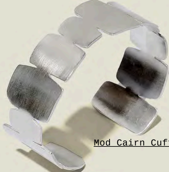
Mod Cairn Cuff