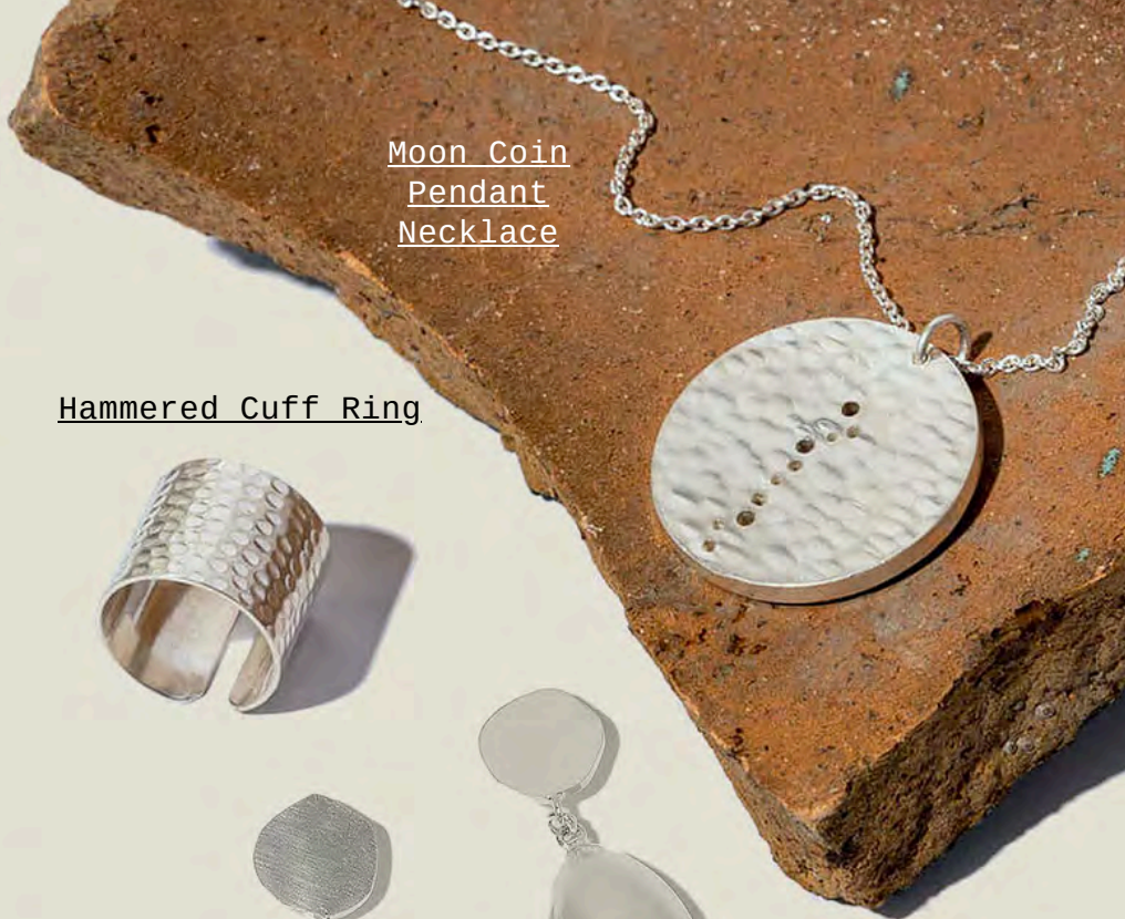
Moon Coin Pendant Necklace