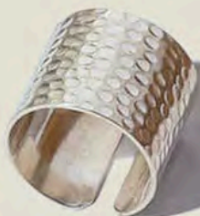
Hammered Cuff Ring