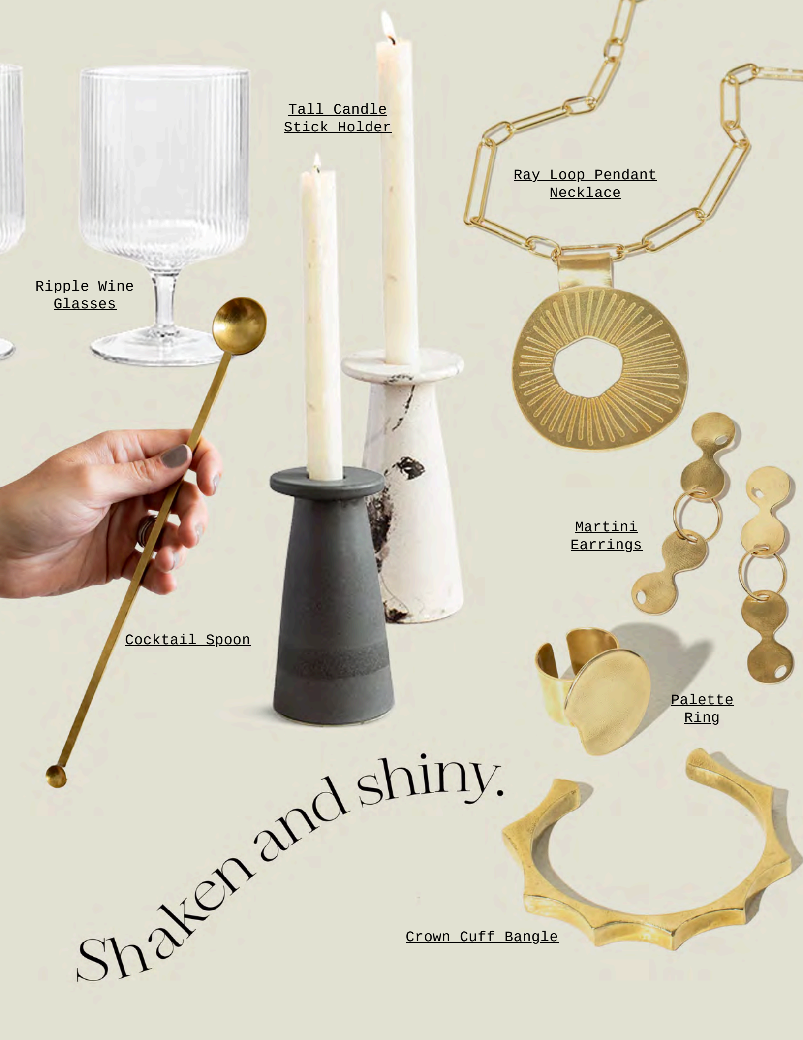
Tall Candle Stick Holder