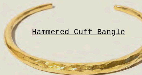
Hammered Cuff Bangle