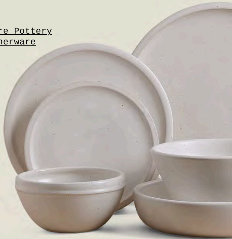
Campfire Pottery Dinnerware