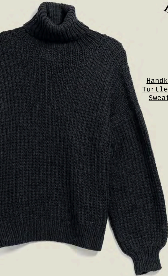
Handknit Turtleneck Sweater