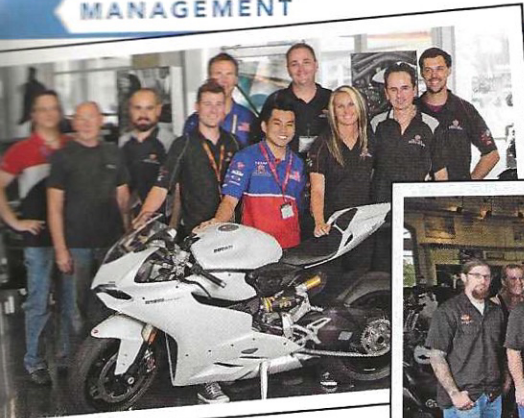
Above: The team at Go AZ Motorcycles. Right: Harley-Davidson Scottsdale staff