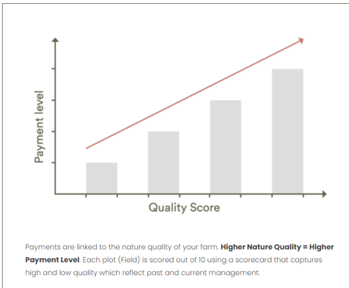
FIGURE 1. RELATIONSHIP BETWEEN THE NATURE QUALITY SCORE AND THE PAYMENT LEVEL. THE HIGHER THE NATURE QUALITY SCORE, THE HIGHER THE PAYMENT LEVEL.