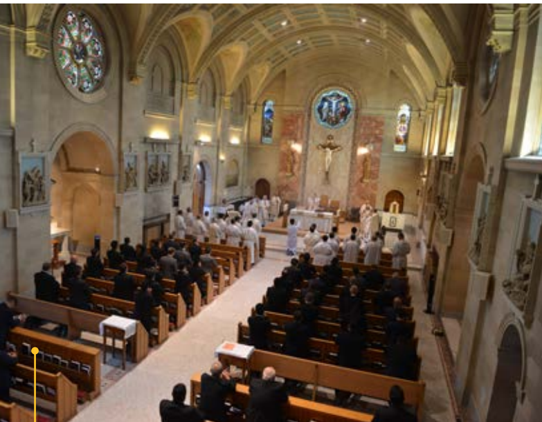
St. Augustine's honoured its alumni with a special reception and Mass at the Seminary on September 19, 2018. It was a beautiful celebration, where priests who have been ordained for over 40 years received a memorial icon of St. Augustine.