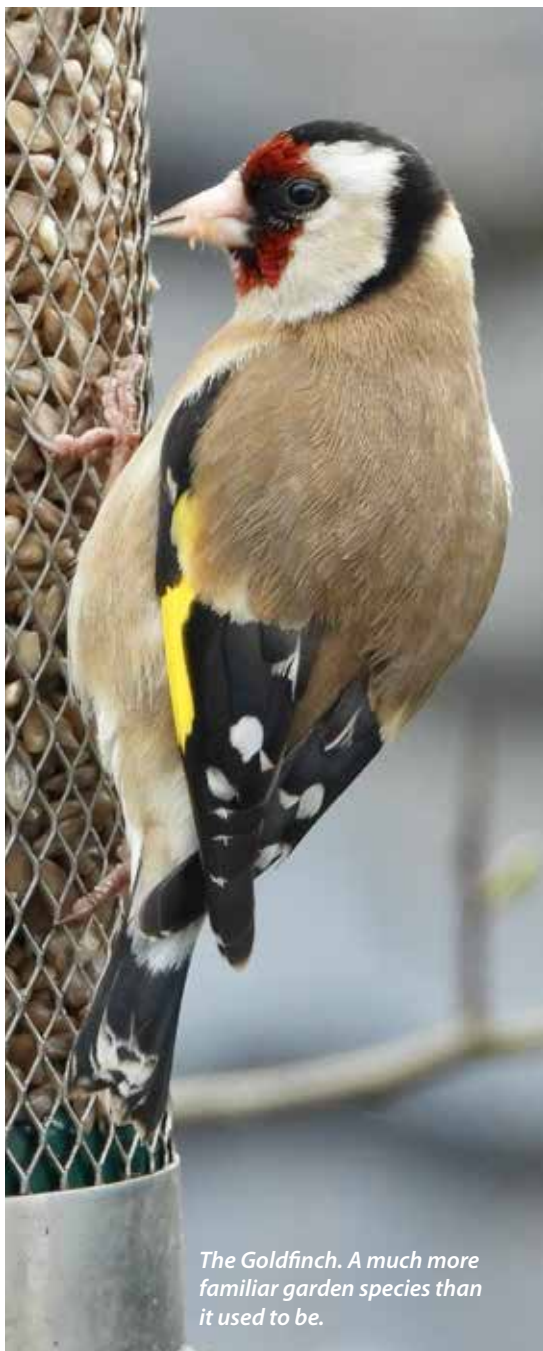
The Goldfinch. A much more familiar garden species than it used to be.