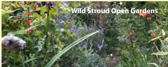
Wild Stroud Open Gardens