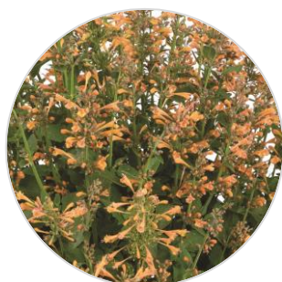
Sunny Sparks™ Tangerine

More varieties in the SUNNY SPARKS™ series: