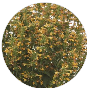
Sunny Sparks™ Yellow

For additional technical growing information: