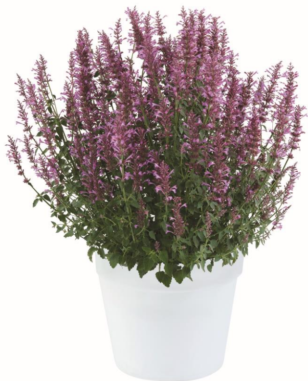
Sunny Sparks™ Pink Imp.