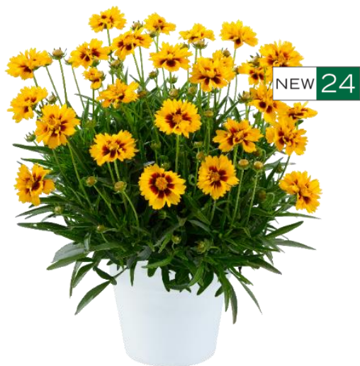
SOLANNA™ Sunset Bright