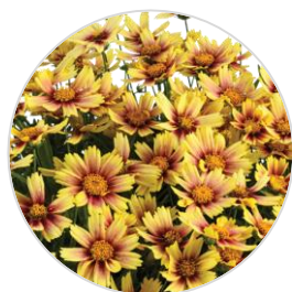
SOLANNA™ Sunset Burst