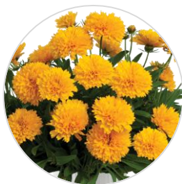
SOLANNA™ Golden Sphere