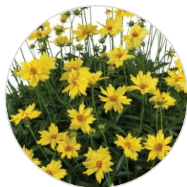
SOLANNA™ Yellow Touch