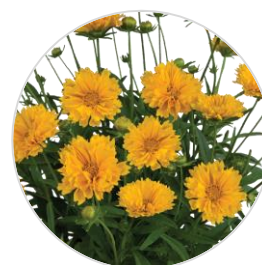
SOLANNA™ Golden Crown