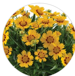
SOLANNA™ Bright Touch