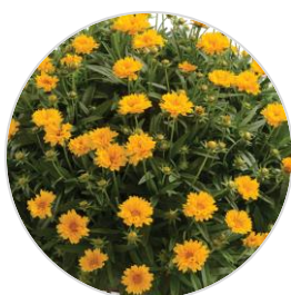
SOLANNA™ Golden Princess