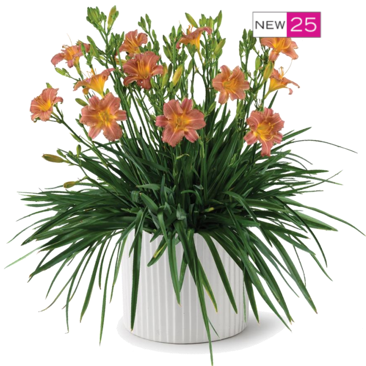
ENDLESSLILY™ Coral Imp.