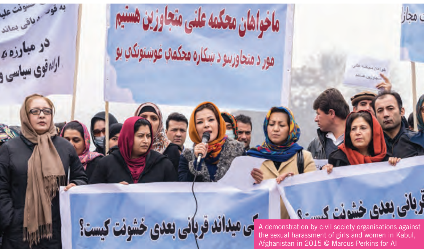
A demonstration by civil society organisations against the sexual harassment of girls and women in Kabul, Afghanistan in 2015

These are women who defend human rights, or people of any gender who defend women’s rights and rights relating to gender, identity and sexual orientation. Their actions and identities challenge patriarchal power structures, harmful social norms and stereotyped gender roles. As a result, they face specific challenges, such as sexual violence, smears, and gender-based legal, social, financial, political, economic and cultural barriers. They are also often stigmatised in their communities because their work – on issues such as sexual and reproductive rights – and leadership roles often conflict with social and cultural gender norms. 11 The risks are even greater for those who face intersecting forms of discrimination: women who belong to racial or ethnic minority groups; are poor, lesbian or trans; are sex workers; or have a combination of these identities are likely to be further marginalised and face particular challenges.