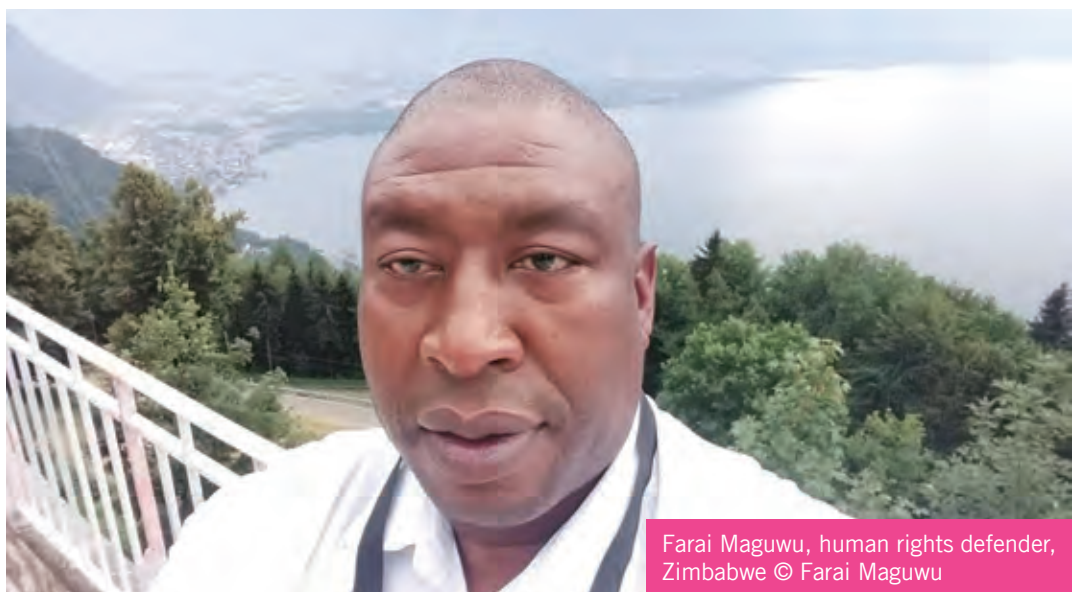
Farai Maguwu, human rights defender, Zimbabwe © Farai Maguwu

Domestic laws that restrict NGOs from receiving foreign funding is another obstacle for human rights defenders. These laws put organisations receiving this kind of funding under increased oversight and burdensome regulatory and fiscal regimes. Some deny NGOs that have received certain foreign funding the right to be registered under national law. For example, Hungarian legislation forces NGOs receiving foreign funding beyond a certain threshold to declare it upon registration, along with the name of the donors. In January 2020, the advocate general of the Court of Justice of the European Union advised that this law restricted the principle of free movement of capital. 17 Since 2012, Russia's Foreign Agents legislation has forced many NGOs to curtail their operations and/or shut down. It prevents NGOs from receiving foreign funding unless they register as foreign agents, which hampers their ability to operate freely. 18 Such legislation has been replicated in other countries, including Egypt. 19