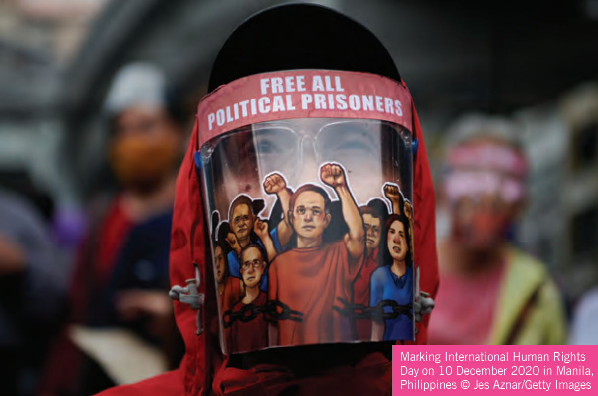
Marking International Human Rights Day on 10 December 2020 in Manila, Philippines

‘Many of these cases (of killings) remain unsolved and it’s basically created a culture of impunity. It is true that if you can do this to journalists it’s easier to commit this to other people too and it makes the human rights situation really bad... [President] Duterte hates the independent media, he hates dissent. Freedom of expression is under siege and the freedom of the press is linked to that.’