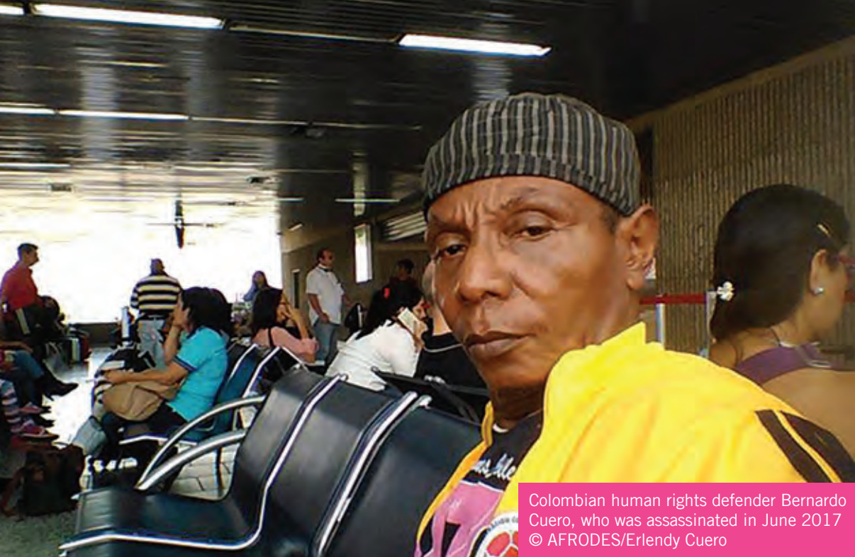
Colombian human rights defender Bernardo Cuero, who was assassinated in June 2017

The pandemic further exacerbates the funding shortages suffered by many human rights defenders and smaller NGOs. Funding bodies have fewer resources to allocate and some have already moved away from human rights work to focus on Covid-19 humanitarian responses. Therefore flexible funding that is sustained over the long-term will be more important than ever for human rights defenders and their communities so they can set up programmes and strategies to tackle abuses.