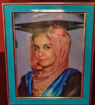
A photo of human rights defender Fatima 'Natasha' Khalil, who was killed in Kabul, Afghanistan in June 2020