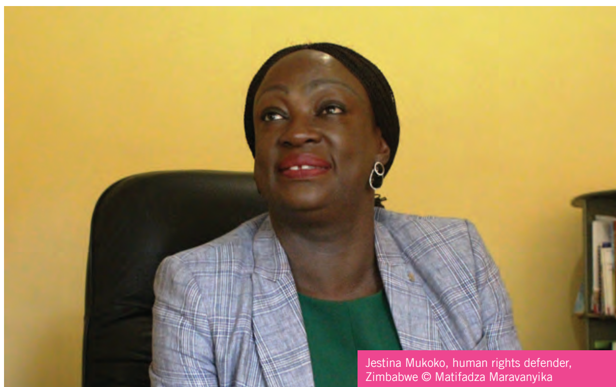
Jestina Mukoko, human rights defender, Zimbabwe

Jestina Mukoko, human rights defender, Zimbabwe