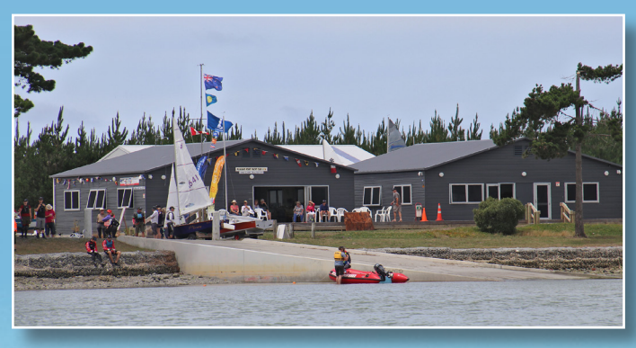
The Club's new facilities, overlooking the Estuary, make it the most modern sailing club in Canterbury.