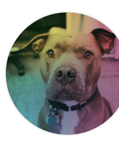
HIPPO Chief Dog Officer

Drop us a note at info@rs21.io to get the conversation started, or apply online. We can't wait to meet you!