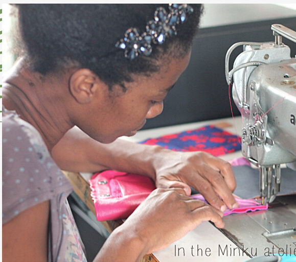
In the Minku atelier

I was glad to easily find the Newman Club at Howard. We did quite a bit of volunteer work. As part of Alternative Spring Break, about ten of us would volunteer in some part of the country, accompanied by our chaplains. We worked with Native American communities in North Carolina; with K-12 children in New Orleans; and did cleaning projects at an archival museum in Cleveland. My time at Howard was greatly enriched by these experiences.